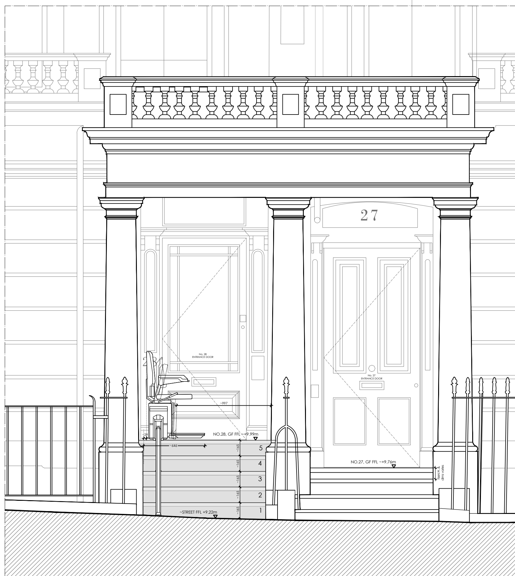
PROPOSED ELEVATION 2 1:25 SCALE