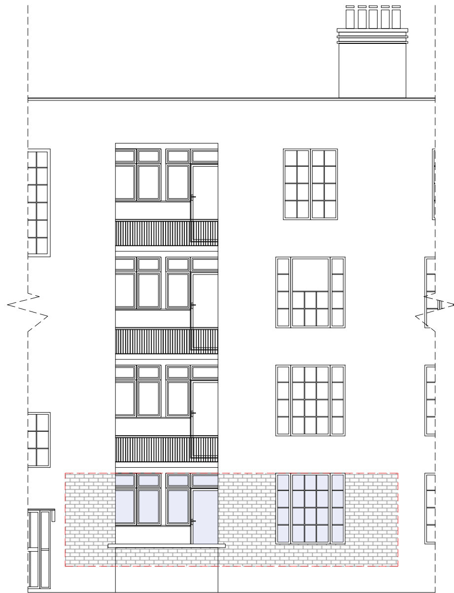
Existing And Proposed West Elevation ( No Proposed Change )