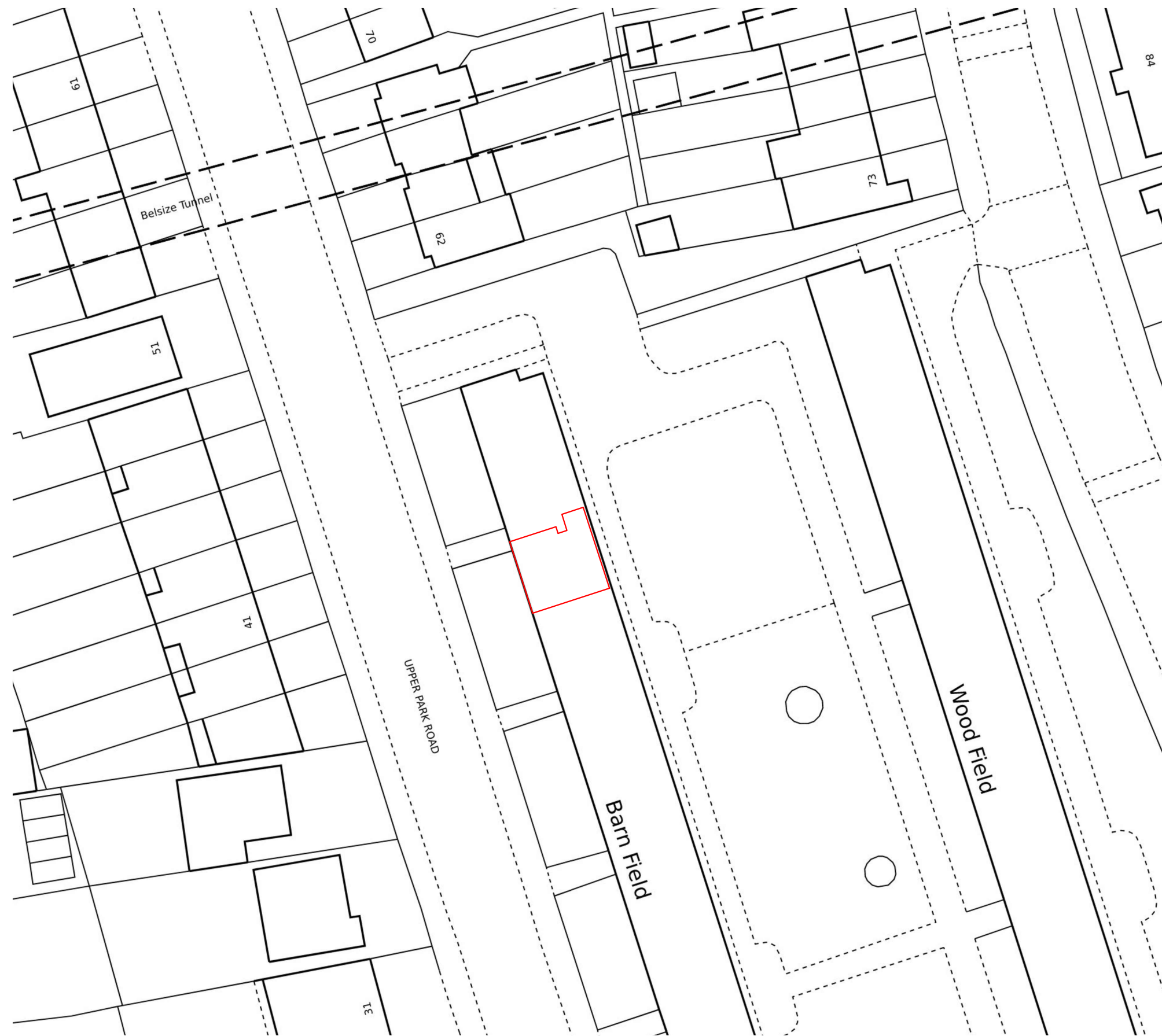
Proposed Block Plan ( No Proposed Change )

Any dimensions shown should be checked on site and discrepancies reported to the Architect prior to construction. Designs are not coordinated with engineer projects. Do not scale for construction purposes.