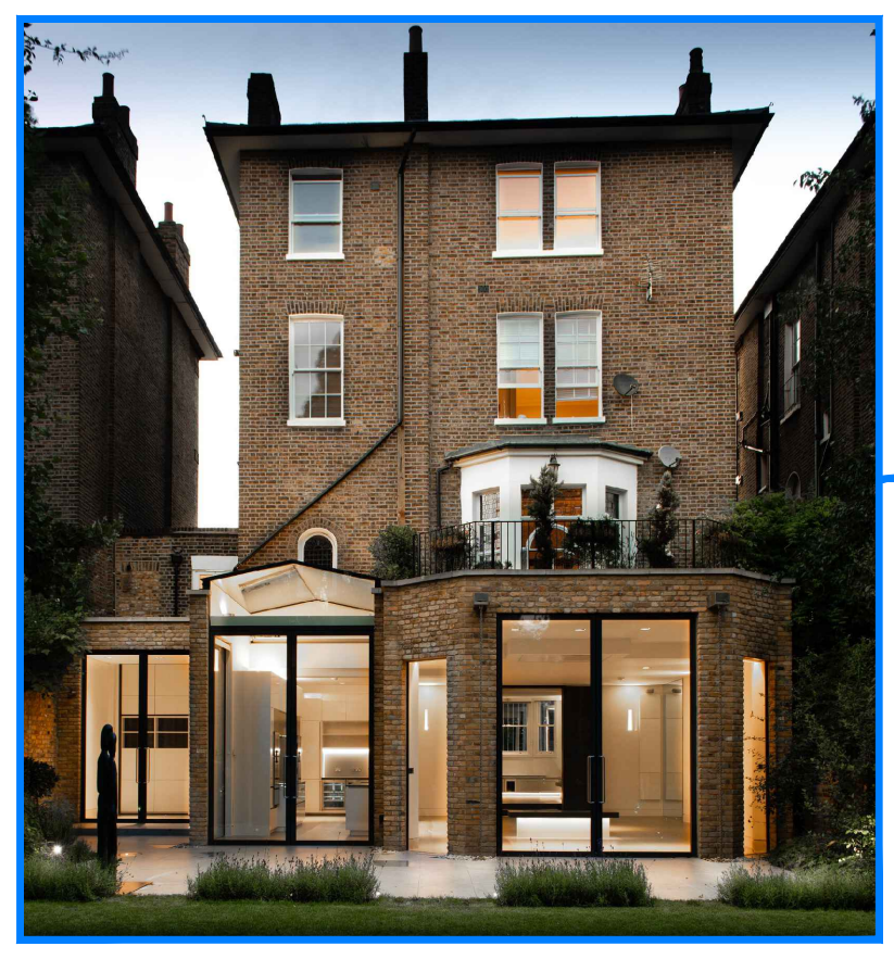
Approved Planning Application ref: 2010/0533/P dated 07.04.10 for 'Amendment to approved application 2009/2298/P (Erection of a side and rear extension to existing garden flat) to include erection of rear conservatory infill extension with glazed roof, modifications to rear patio doors and reduction in size of approved rear extension. of a double storey extension, single storey rear extension