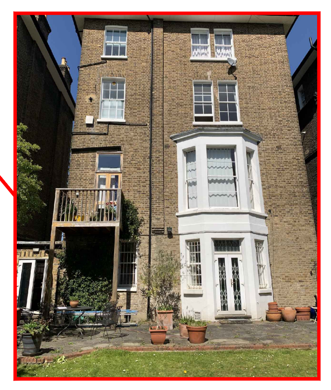
Existing 133 King Henry's Road Rear Elevation