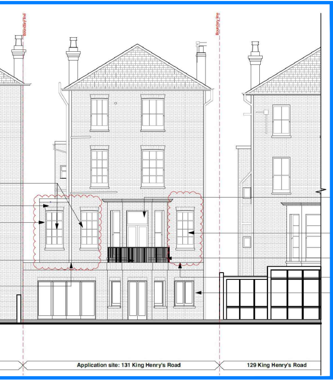
Approved Planning Application ref: 2020/5917/P dated 20.08.21 for 'Erection of a double storey extension, single storey rear extension with terrace above, installation of a bin store enclosure in front garden'