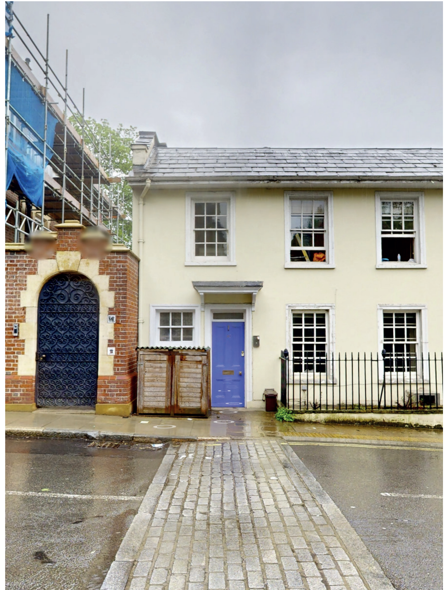
Photo of front elevation