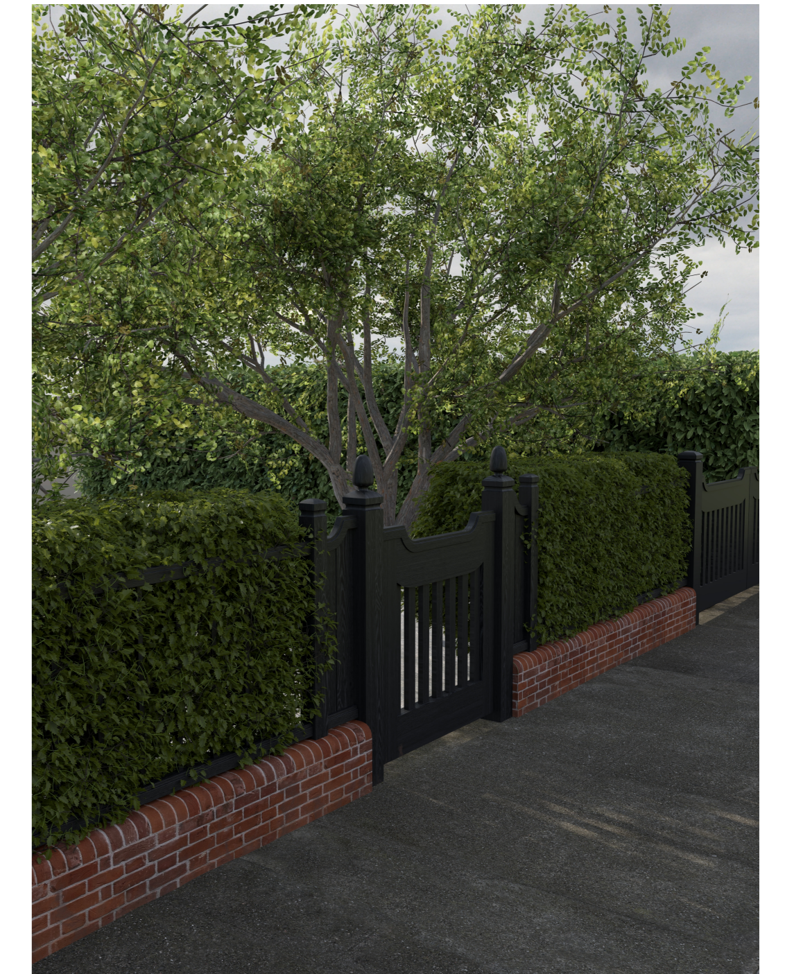
VISUALISATION OF PROPOSED BOUNDARY TREATMENT