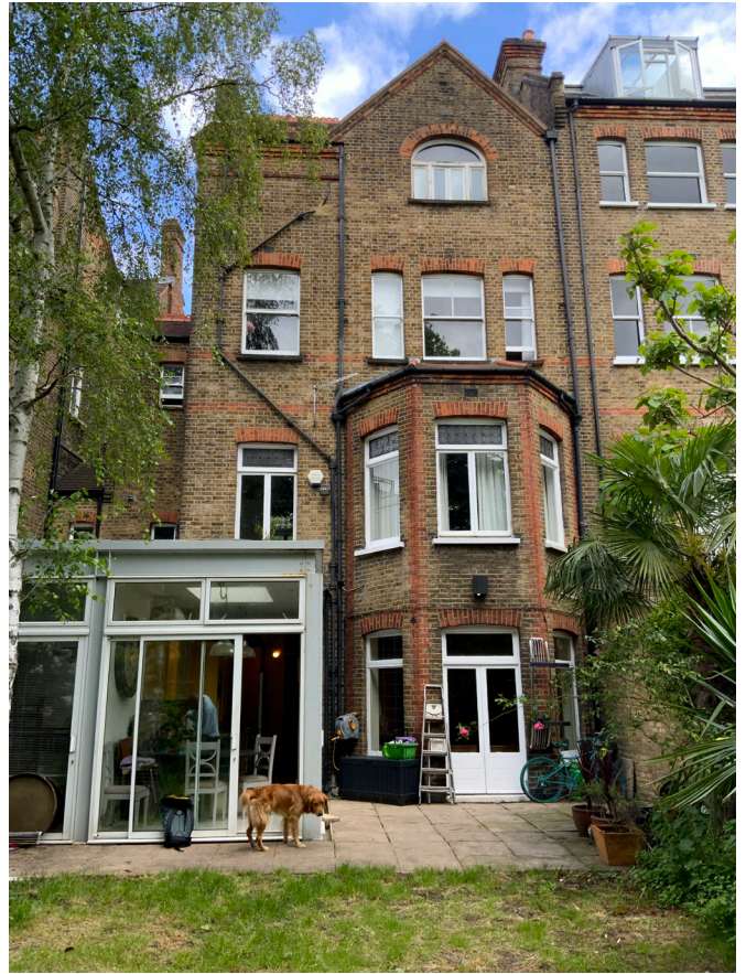
Photos of existing site