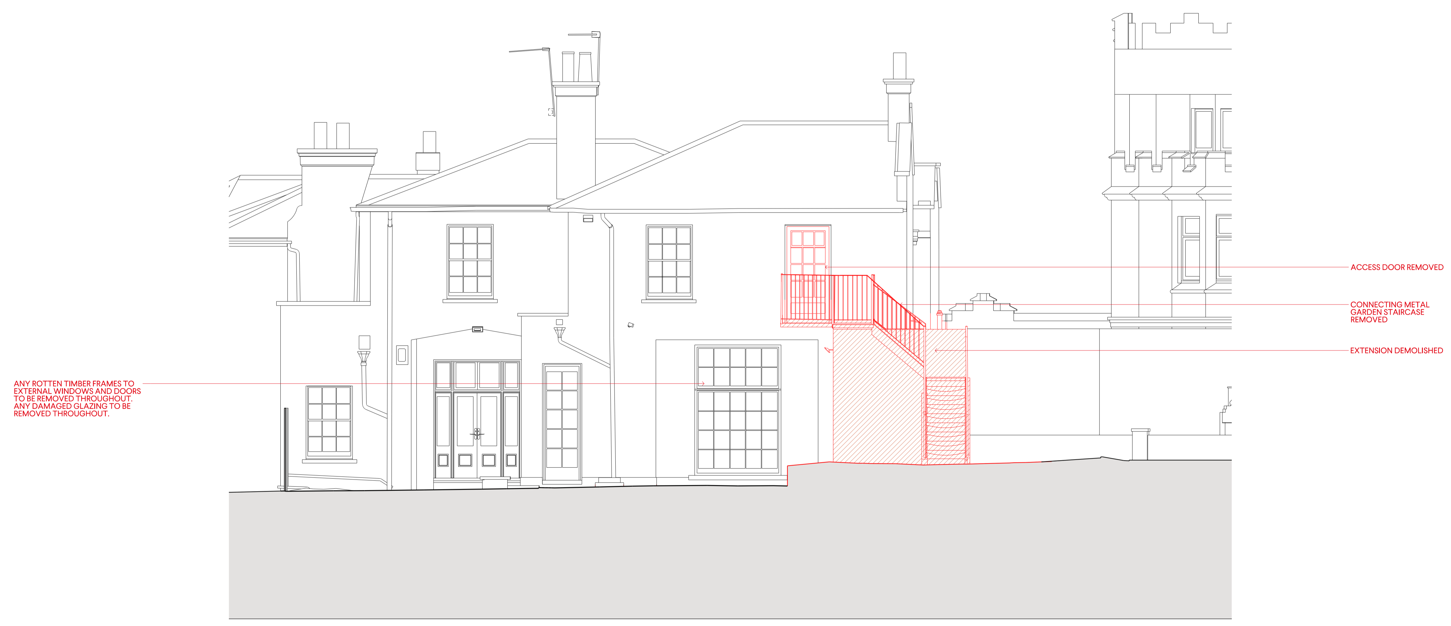
1 1:50 REAR ELEVATION DEMOLITIONS