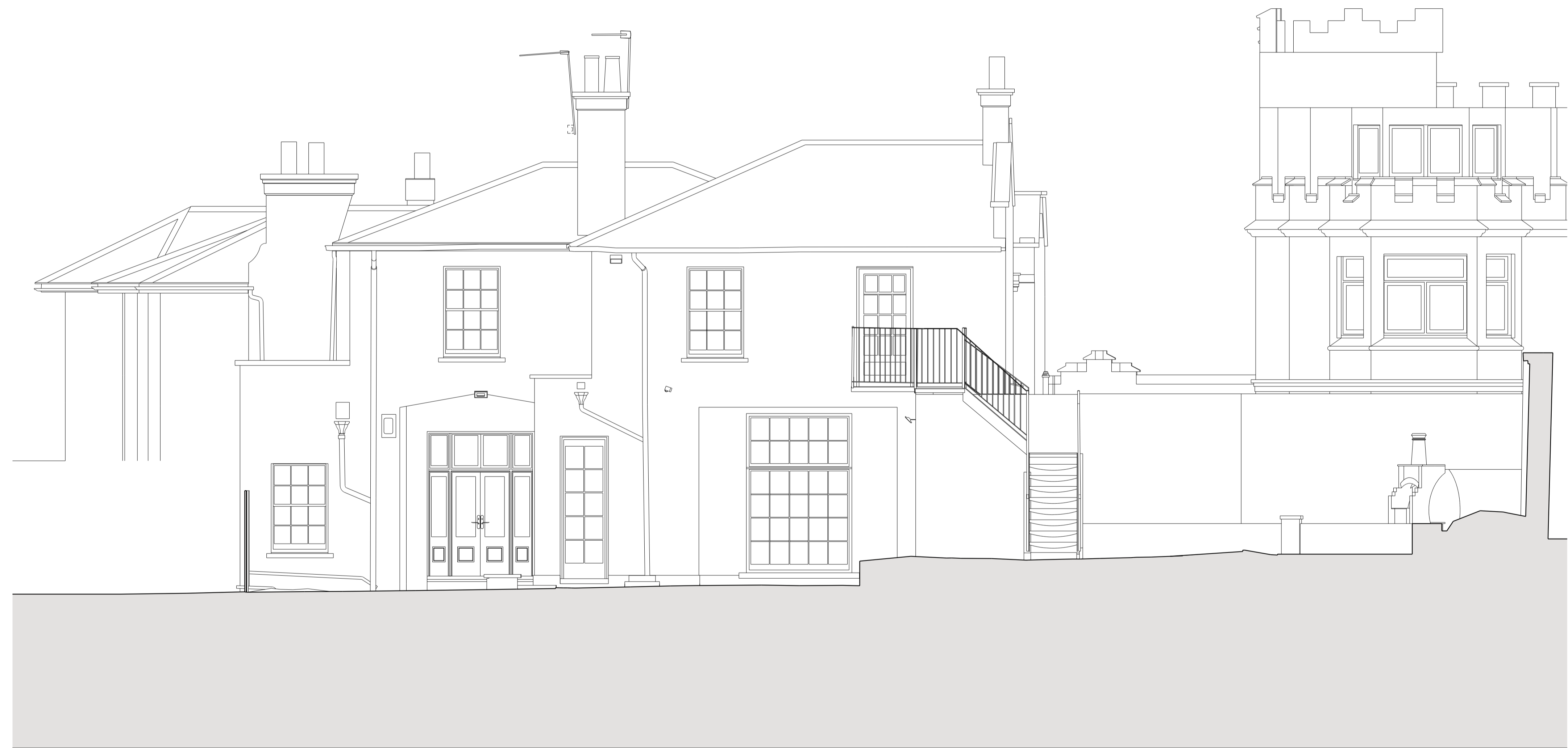
1 1:50 EXISTING REAR ELEVATION