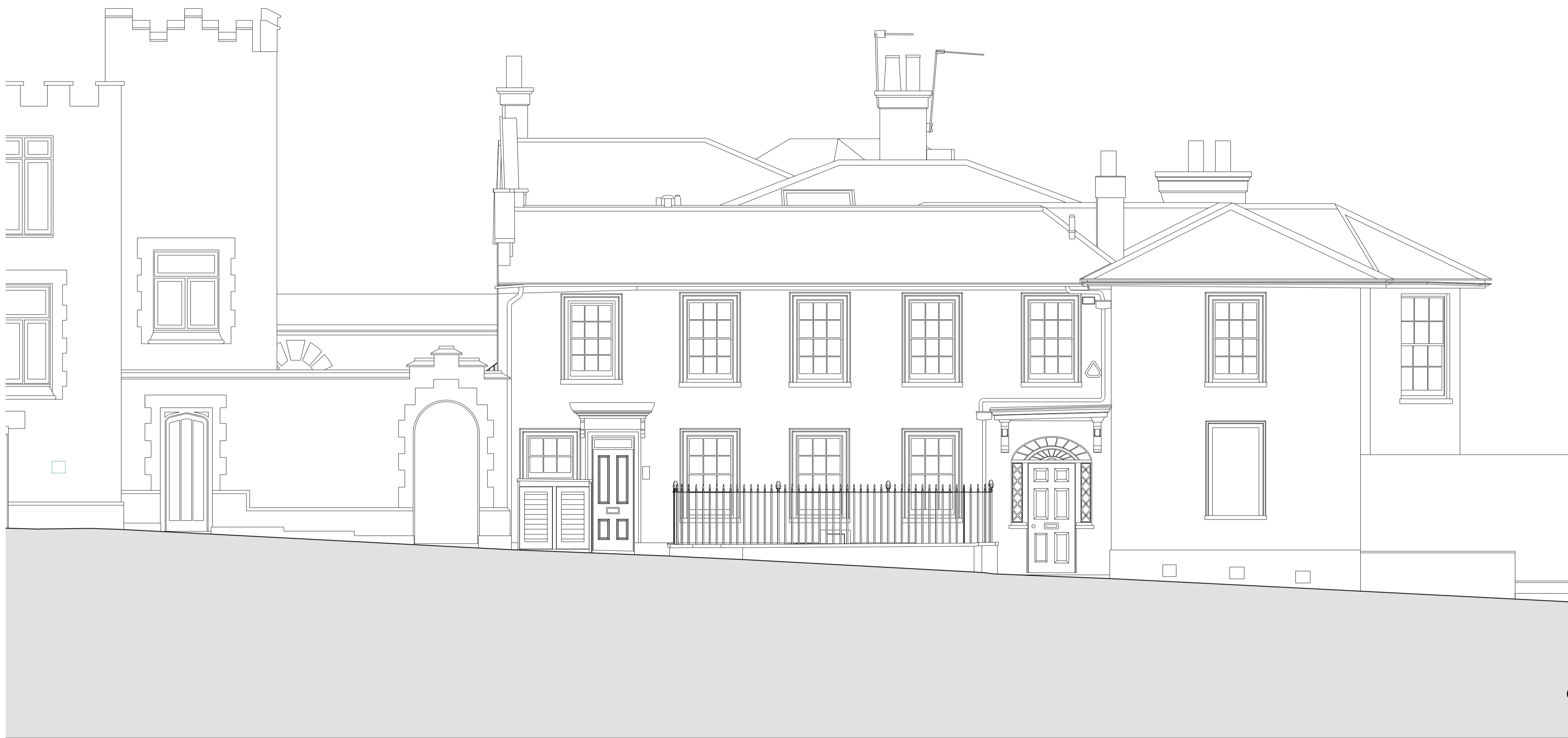
1 1:50 EXISTING FRONT ELEVATION