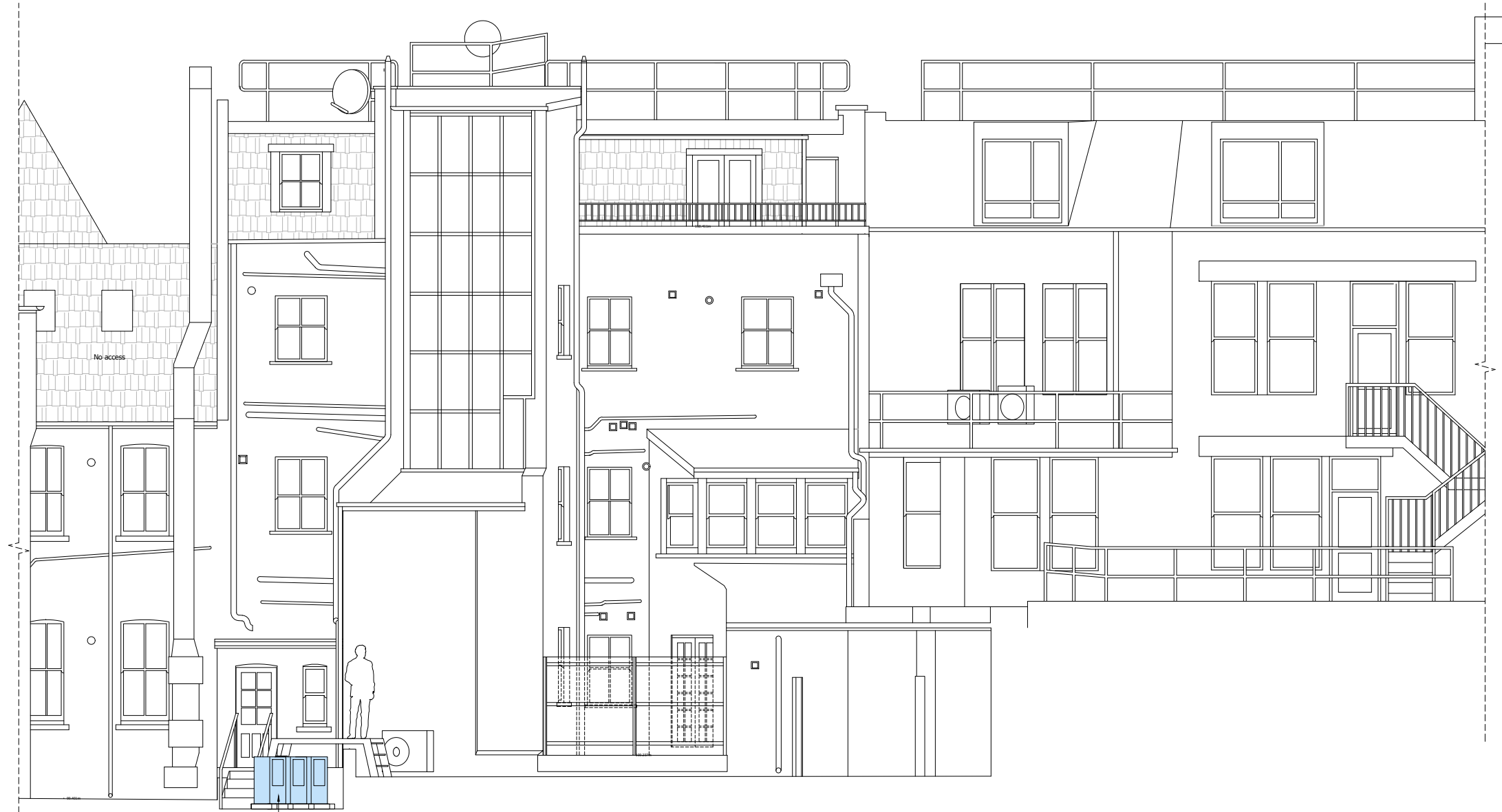
Elevation A-A (Rear)

Existing condensing plant for 154 Shaftesbury Avenue removed, new condensing plant installed to same location below existing access gantry.