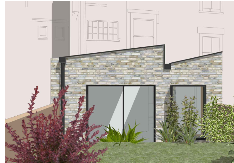
Garden view of proposed extension