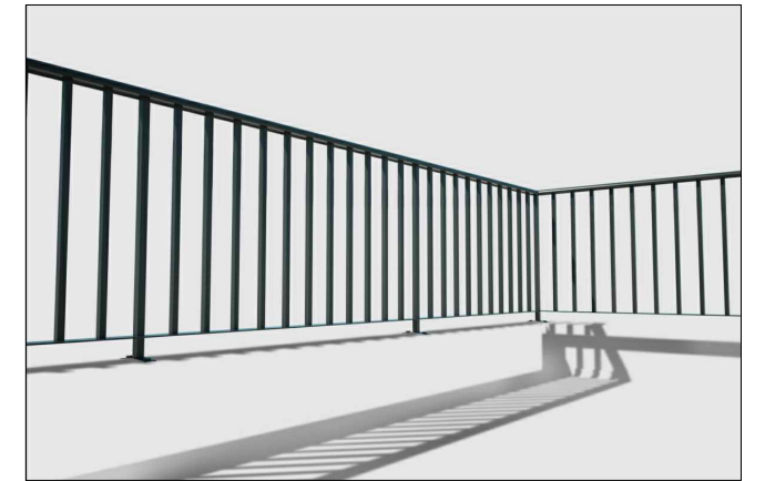
2 PROPOSED BLACK METAL BALUSTRADE TO ROOFTERRACE SCALE N/A