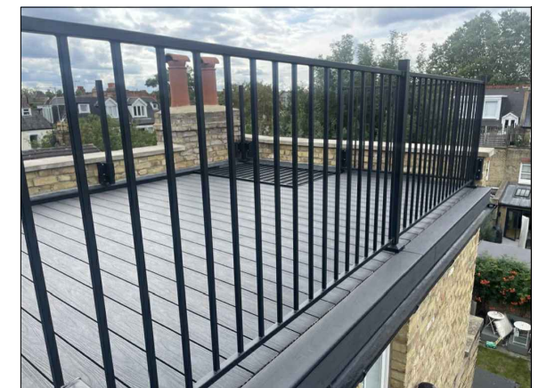
3 PROPOSED BLACK METAL BALUSTRADE TO ROOFTERRACE SCALE N/A