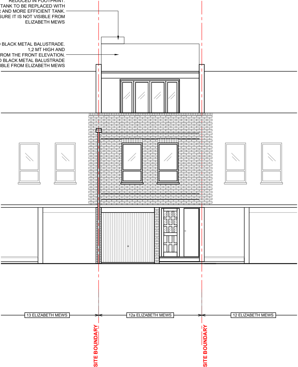
1 FRONT ELEVATION - PROPOSED_ SCALE 1:100 @ A3

PROPOSED BLACK METAL BALUSTRADE. 1.2 MT HIGH AND 2.5 MT RECESSED FROM THE FRONT ELEVATION. THE PROPOSED BLACK METAL BALUSTRADE WILL NOT BE VISIBLE FROM ELIZABETH MEWS