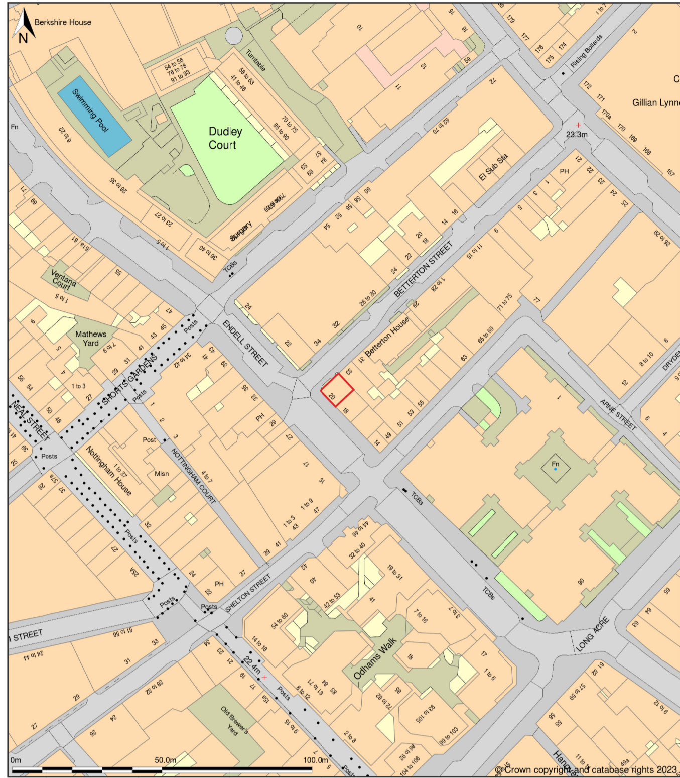
1 Location Plan 1:1250 @ A1