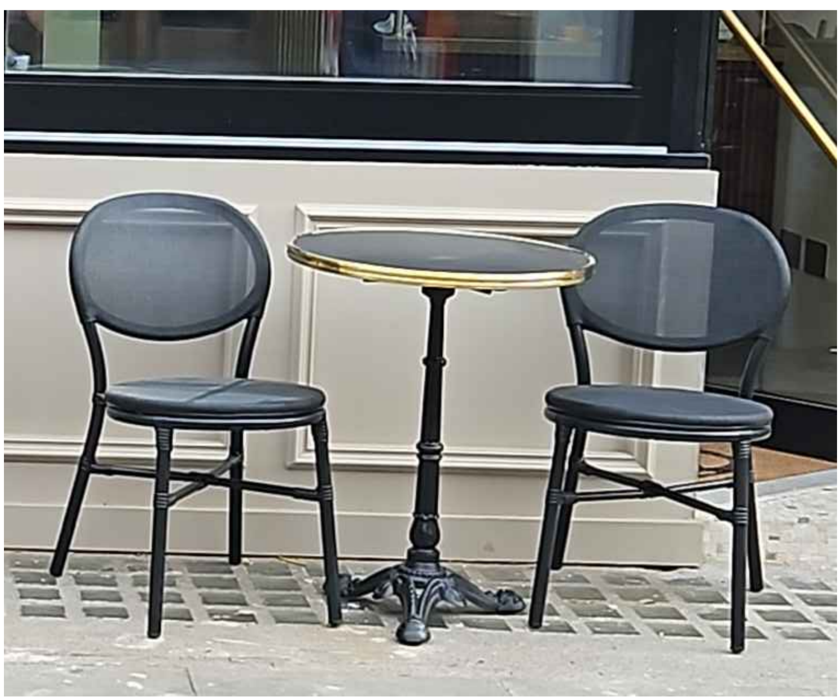
2 Proposed External Table & Chair Image