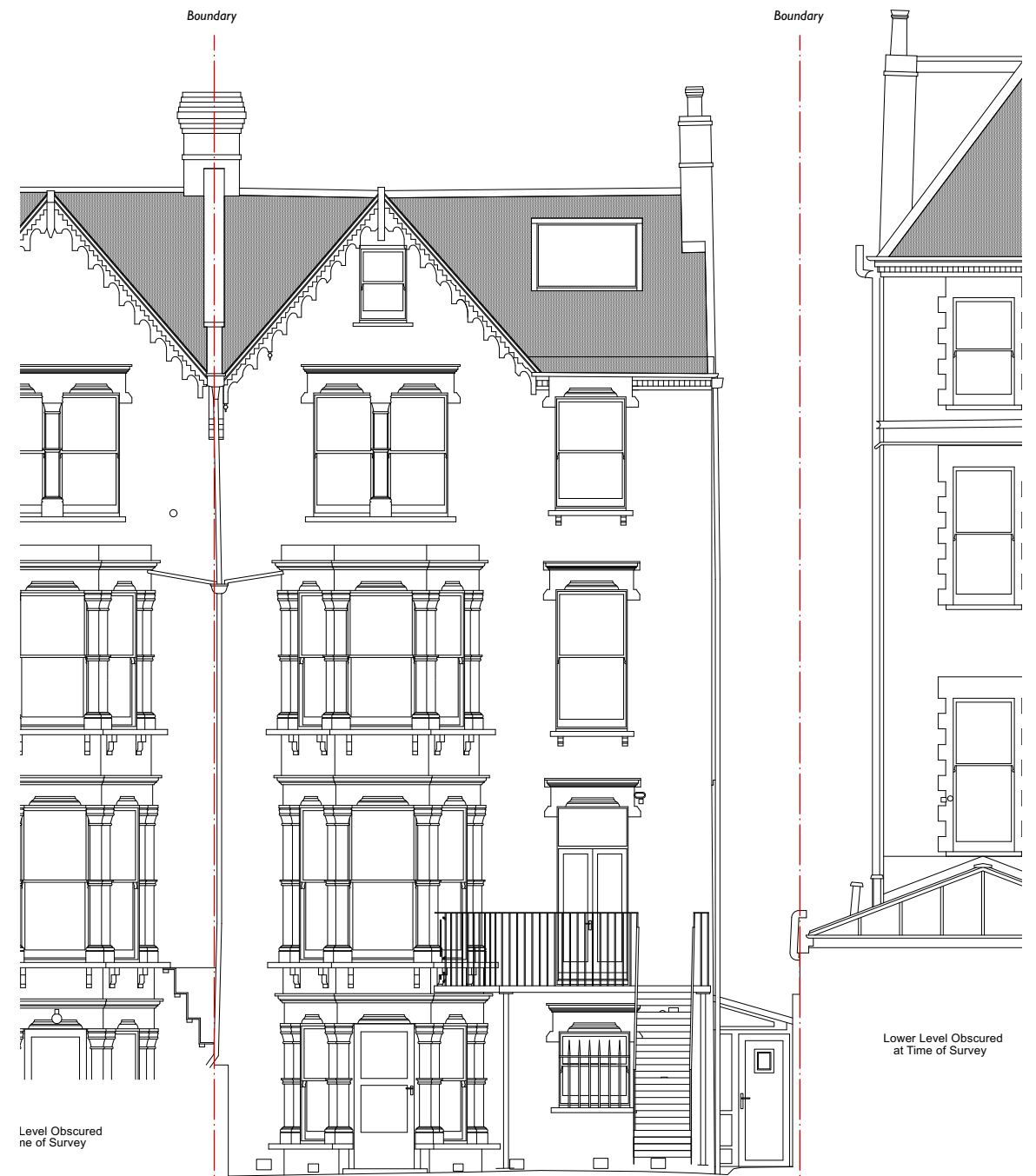
3 Side (North West) Elevation Scale: 1:100