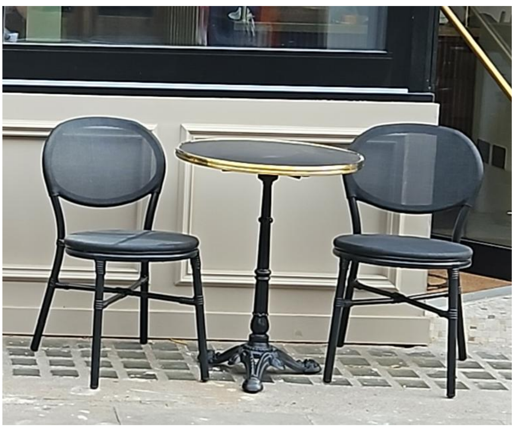
2 Proposed External Table & Chair Image