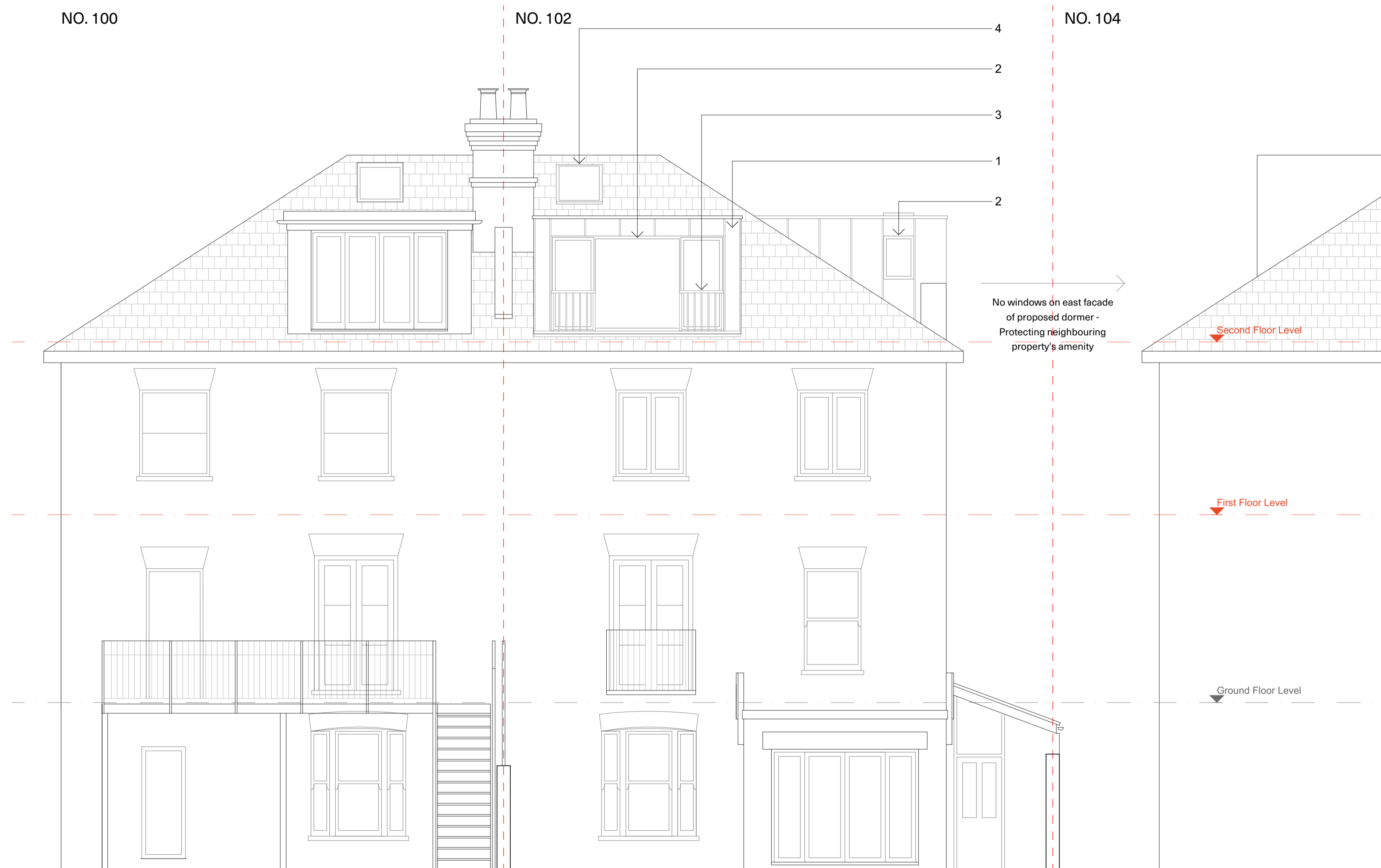
03. Proposed Rear Elevation