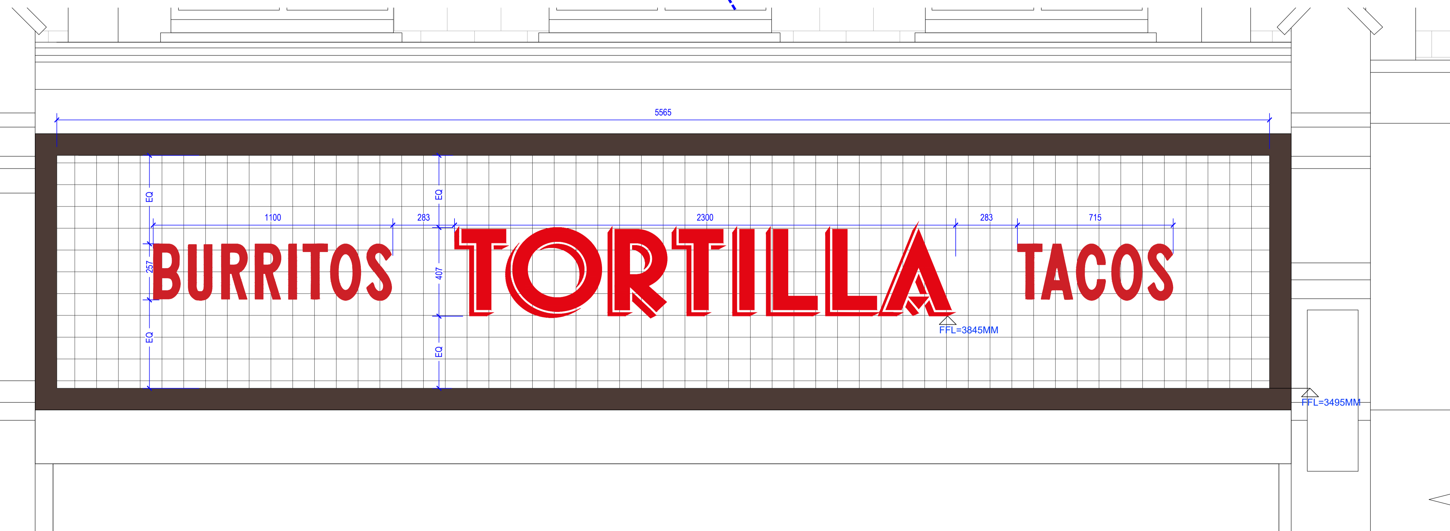
SIGN A - FRONT ELEVATION

BASED ON LIMITED INFORMATION AND SUBJECT TO CHANGE FOLLOWING SITE SURVEY. PLANS ARE FOR DRAFT FEASIBILITY PURPOSES ONLY