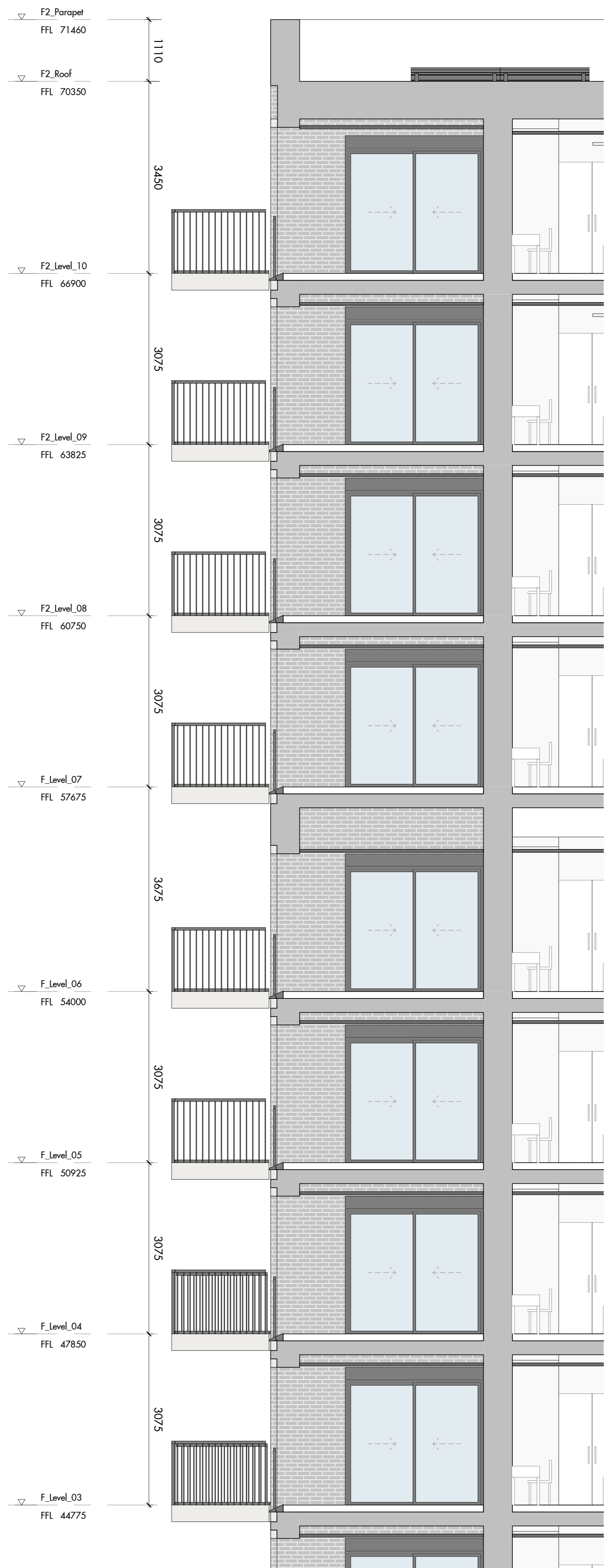
Building F: South Elevation