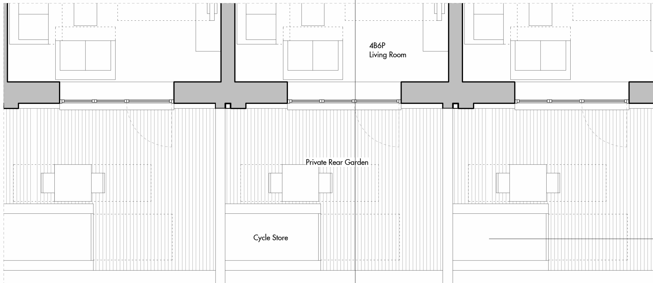
04 Block E2 - Townhouses South Elevation - Level 00 1 : 50