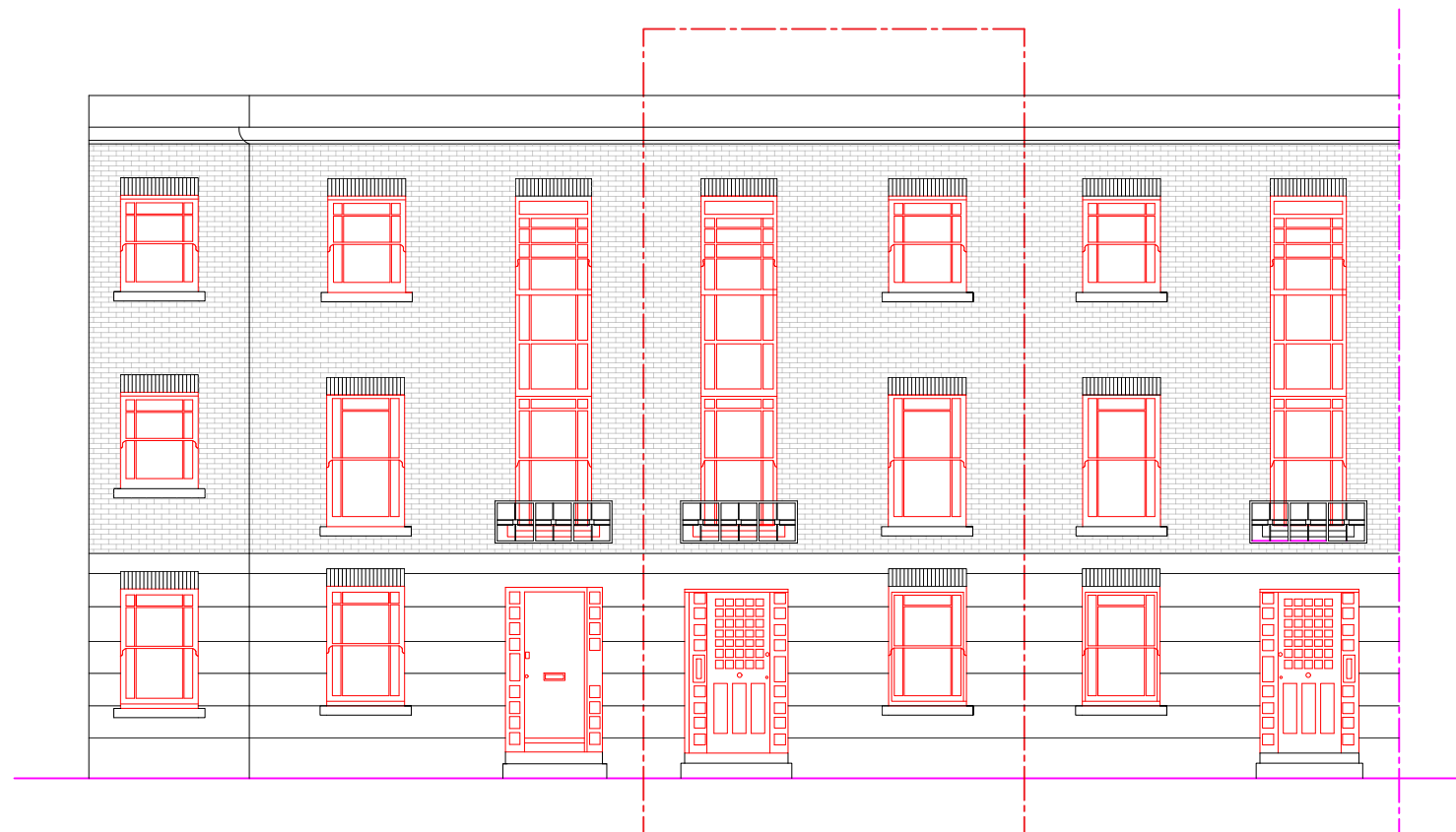
2 Proposed North Elevation Scale: 1:100 @ A3