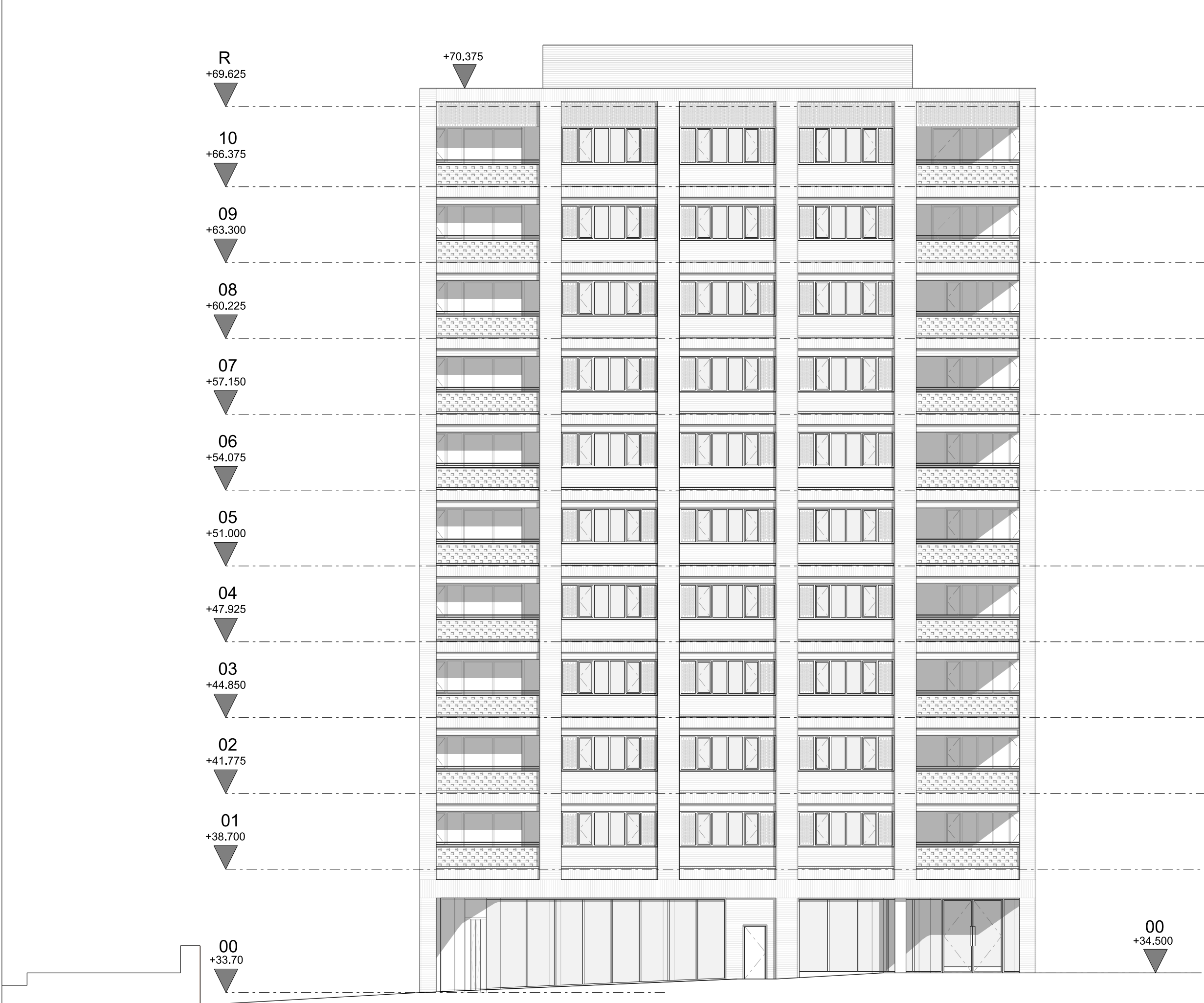
01 BLOCK E1 - 1:150 @ A1 NORTH EAST ELEVATION

Notes This drawing is copyright Piercy&Company. Do not scale from this drawing. All dimensions and levels to be checked on site by the contractor and such dimensions to be his responsibility. Report all drawing errors, omissions and discrepancies to the architect. DISCLAIMER This document may be issued in an editable digital CAD format to enable others to use it as background information to make alterations and/or additions. In that instance the file will be accompanied by a PDF version as a record of the original file. It is for those parties making such alterations and/or additions to ensure that they make use of current background information. Piercy&Company accepts no liability for either: any such alterations and/or additions to the background information by others; or any other changes made by others to the architectural content of the background information itself.