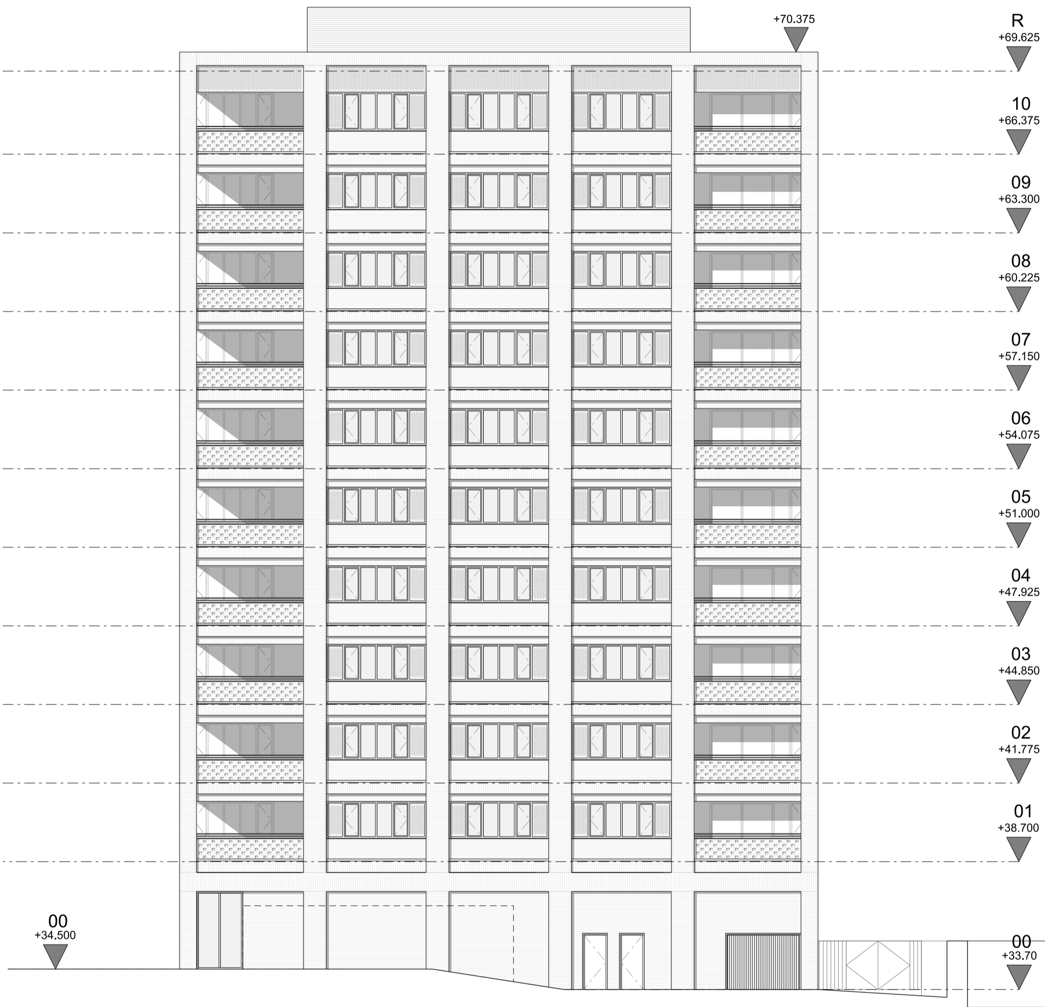
03 BLOCK E1 - 1:150 @ A1 SOUTH WEST ELEVATION

Notes This drawing is copyright Piercy&Company. Do not scale from this drawing. All dimensions and levels to be checked on site by the contractor and such dimensions to be his responsibility. Report all drawing errors, omissions and discrepancies to the architect. DISCLAIMER This document may be issued in an editable digital CAD format to enable others to use it as background information to make alterations and/or additions. In that instance the file will be accompanied by a PDF version as a record of the original file. It is for those parties making such alterations and/or additions to ensure that they make use of current background information. Piercy&Company accepts no liability for either: any such alterations and/or additions to the background information by others; or any other changes made by others to the architectural content of the background information itself.