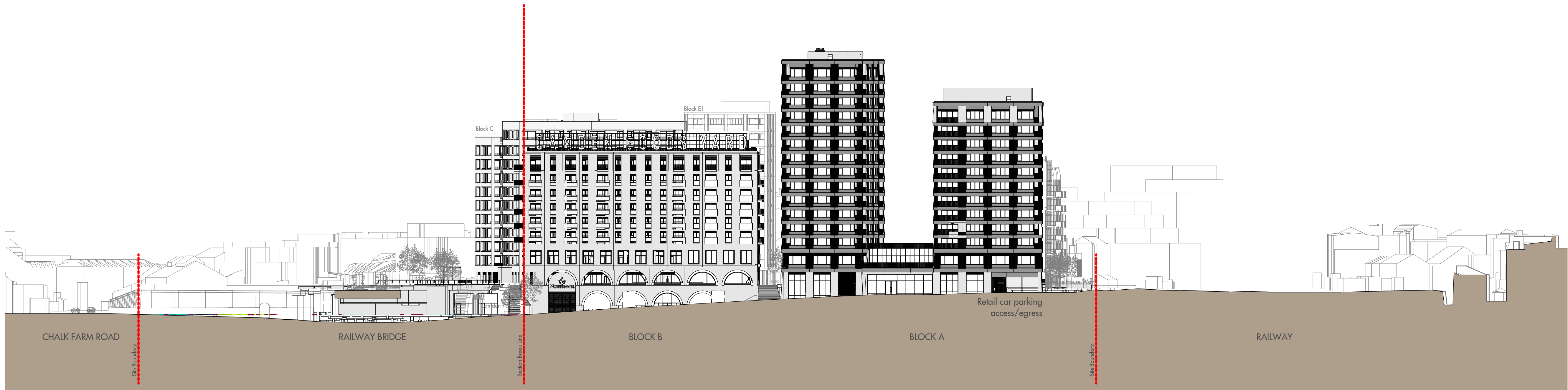
SECTION GG 1 : 500