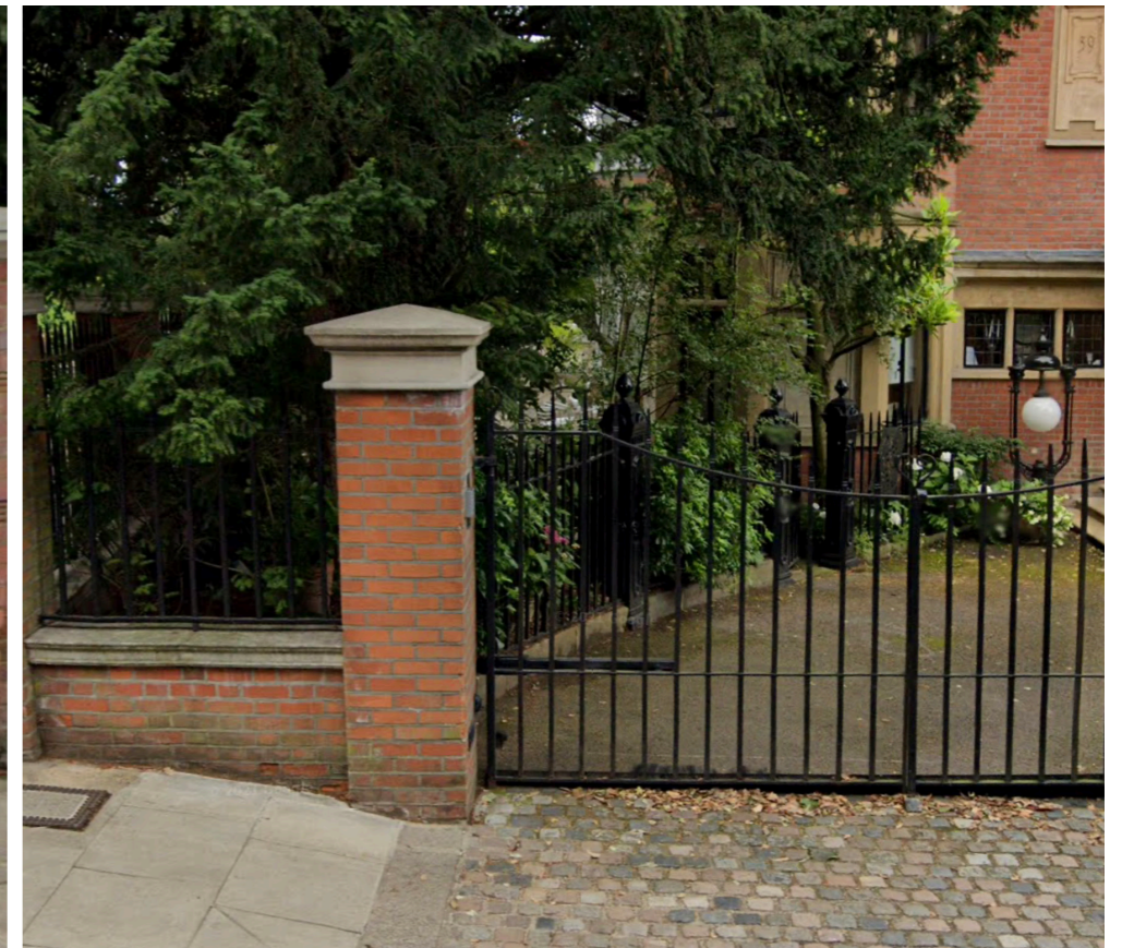
Traditional railings with finials to 39 Redington Road