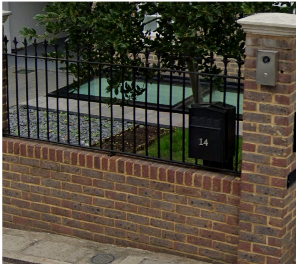
Traditional railings with finials to 14 Redington Road