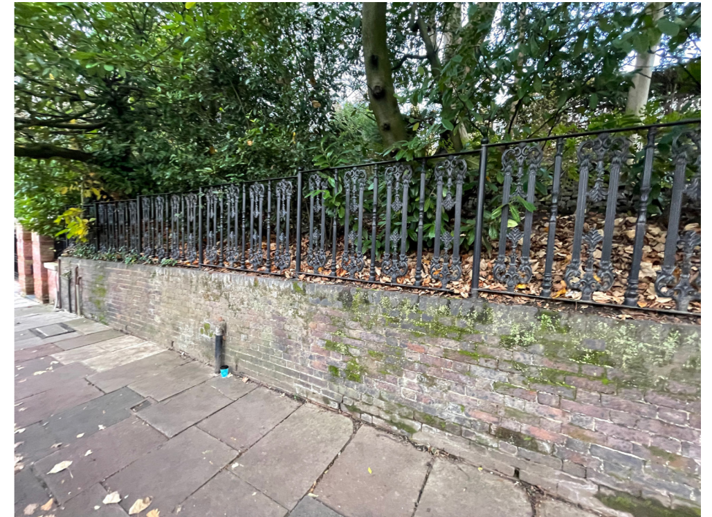
Existing ornate railings to 20 Redington Road

There are a number of local instances of railings adjacent to the application site. It is proposed that the revised railing design is more appropriate to the frontage than those consented in application 2024/2871/P.