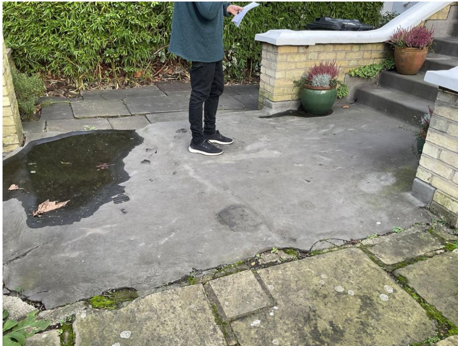
Existing asphalt surface to entrance path