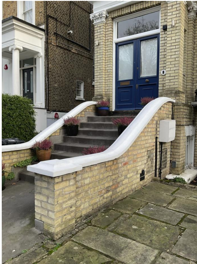
Entrance steps to house