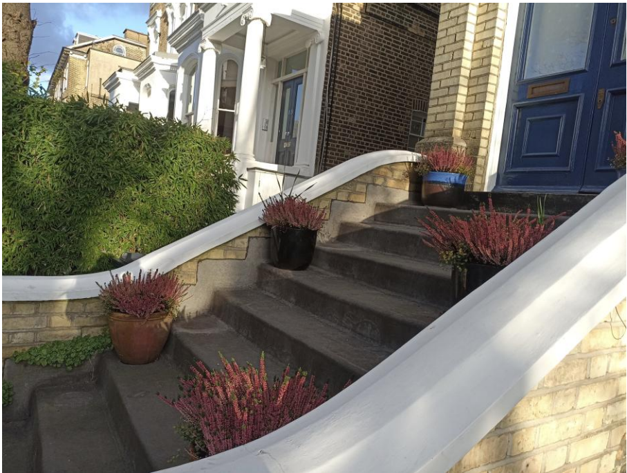
Asphalt surface to entrance steps