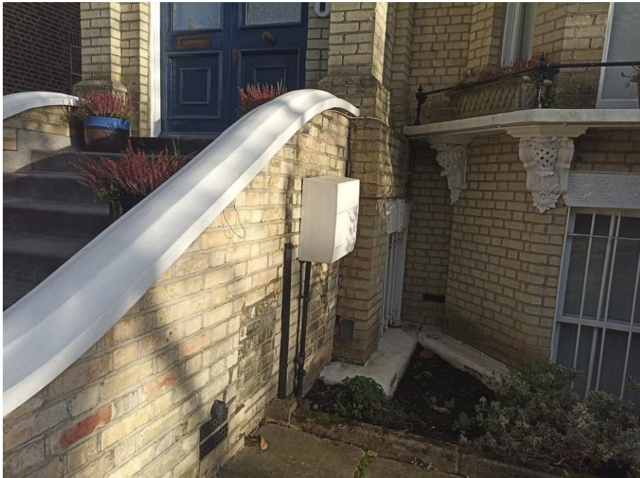
Side view of entrance steps