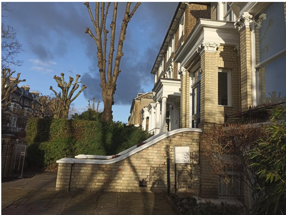
Side view of existing steps