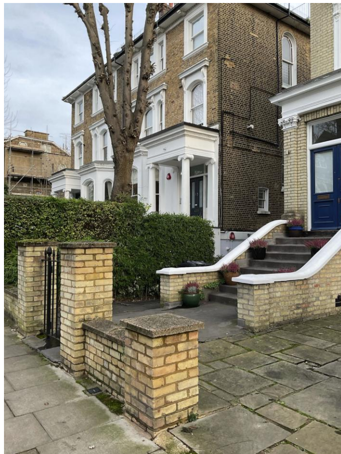
Existing paving and garden piers