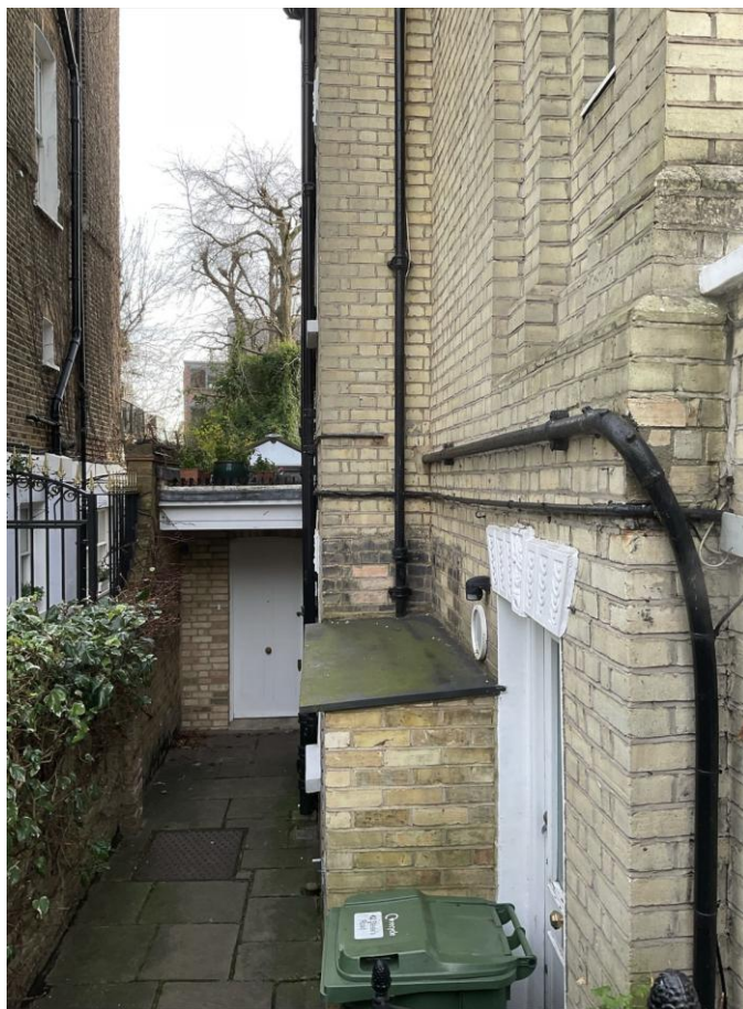
Access to lower ground floor and garden