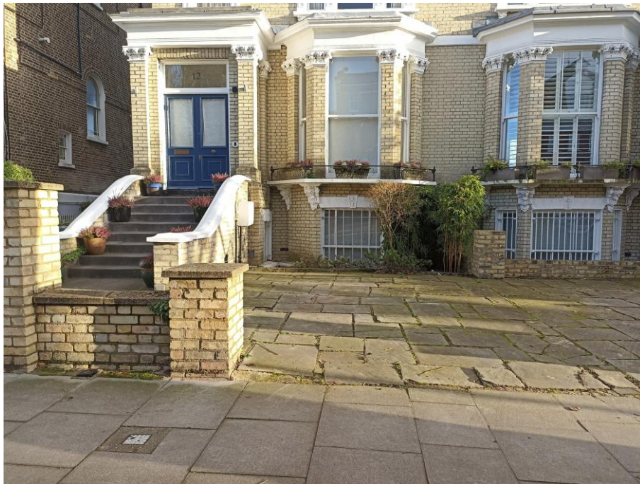
Existing paving to front driveway