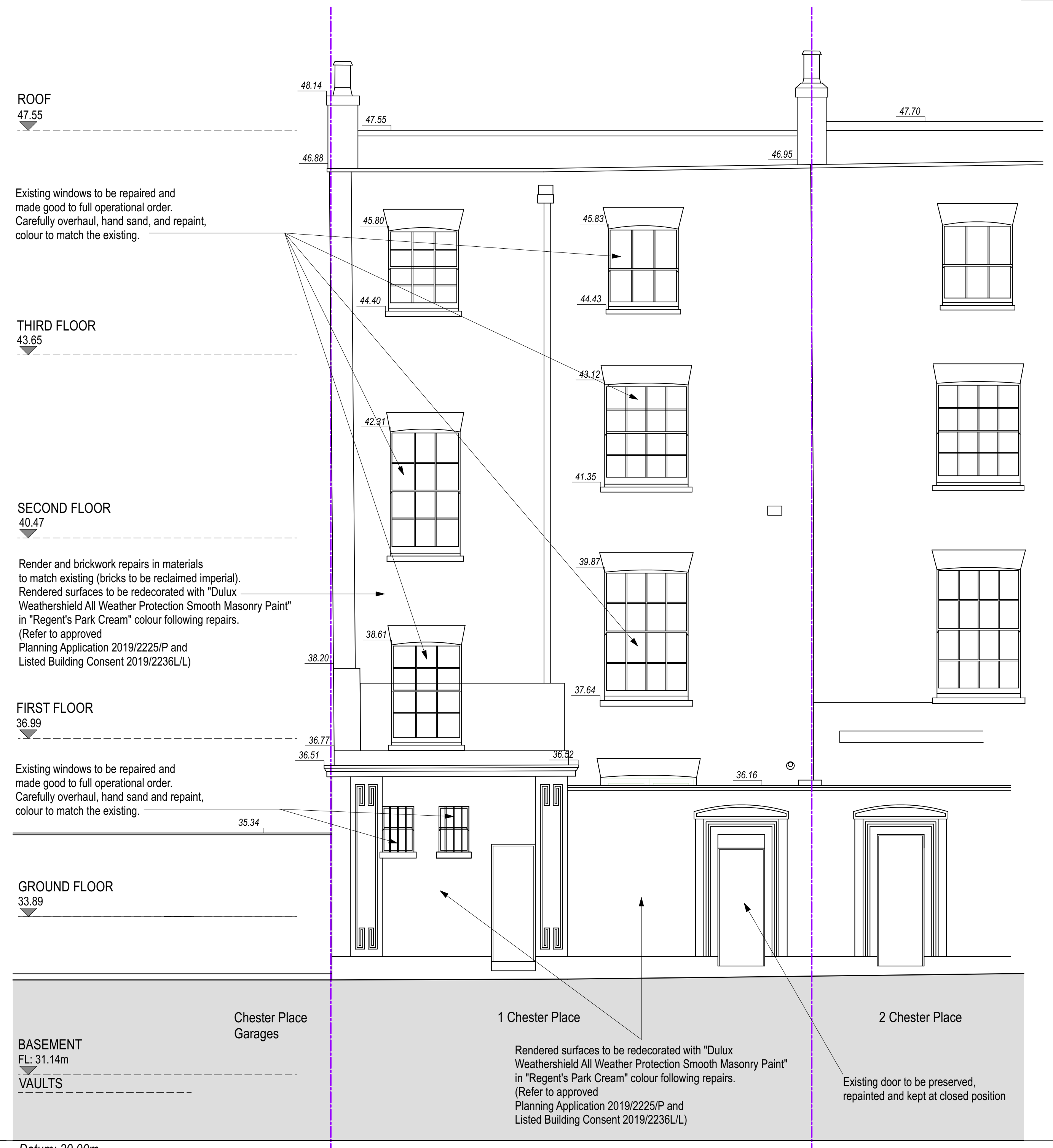
ELEVATION 4 ON SECTION OVERVIEW