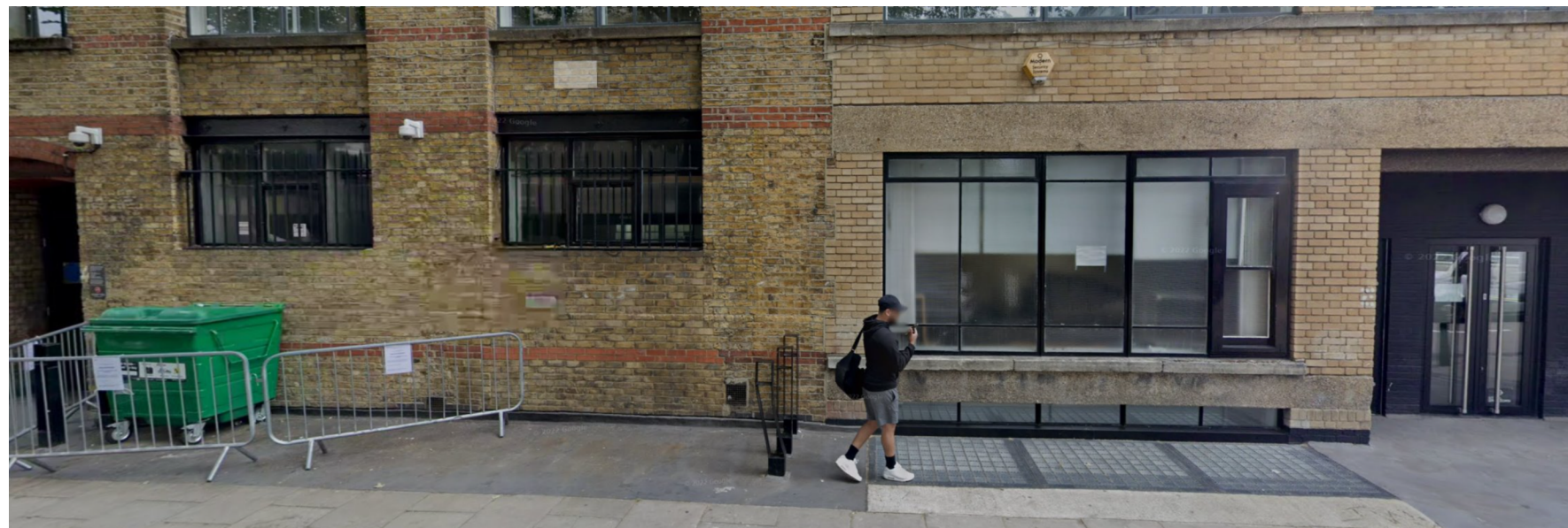
2 Existing West Elevation - Photo