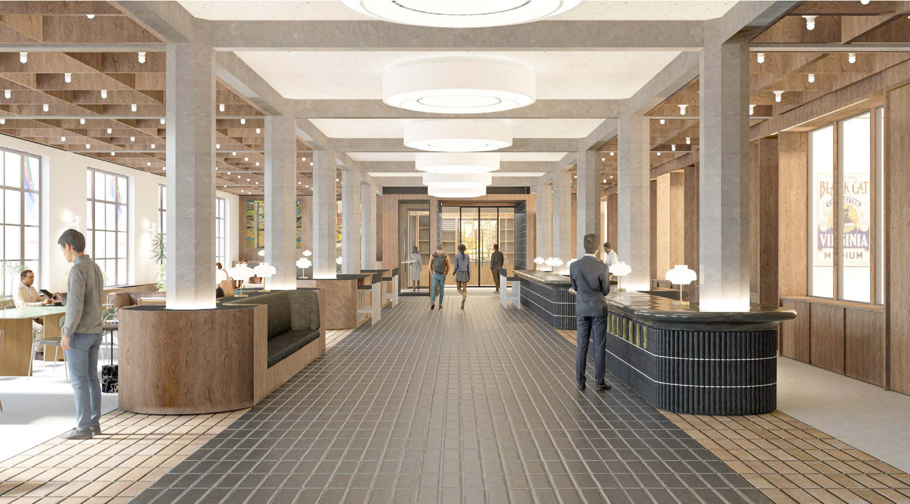
Below: Entrance Visual