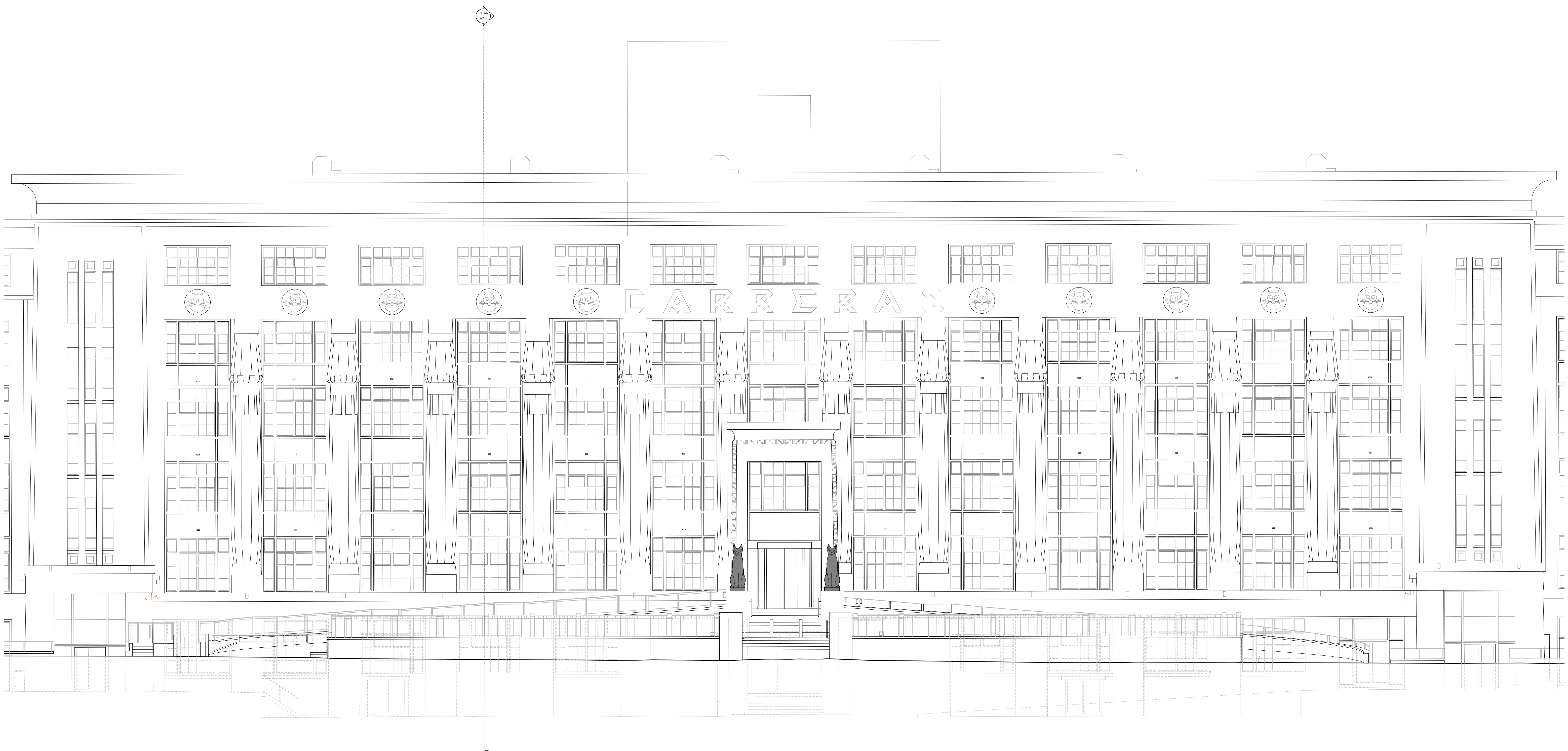
01 EXISTING - FRONT (EAST) ELEVATION (CLOSE UP) Scale 1:100 @A1