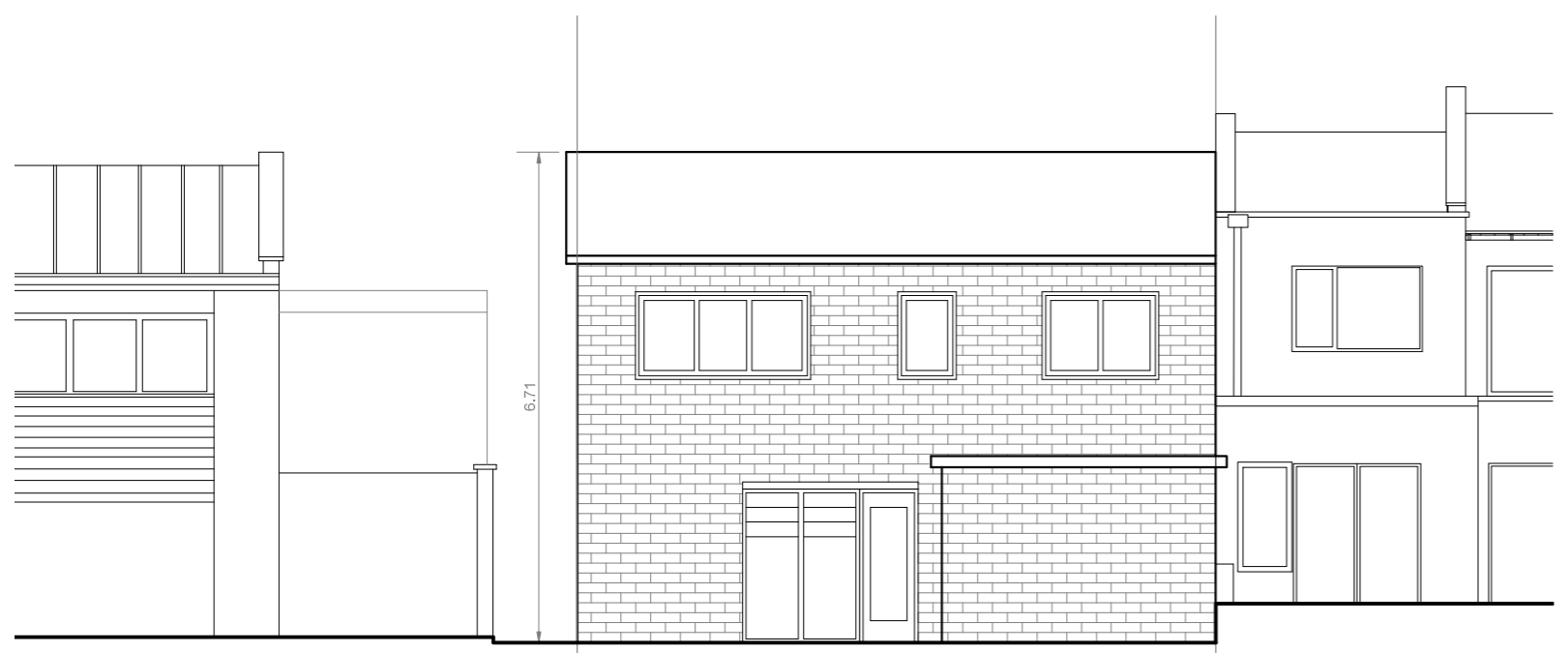
PROPOSED REAR ELEVATION SCALE 1:100 @ A3

NOTES: THIS DRAWING IS THE SUBJECT OF COPYRIGHT AND DESIGN RIGHTS AND SHALL NOT BE REPRODUCED, LOANED, COPIED OR SUBMITTED TO ANY OTHER PARTY WITHOUT CONSENT.