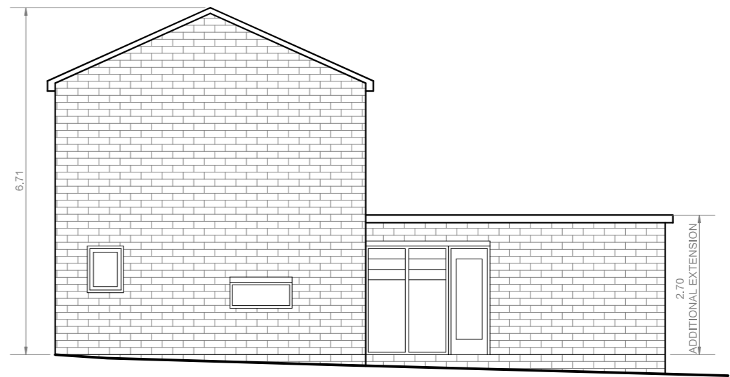
PROPOSED SIDE ELEVATION 1 SCALE 1:100 @ A3