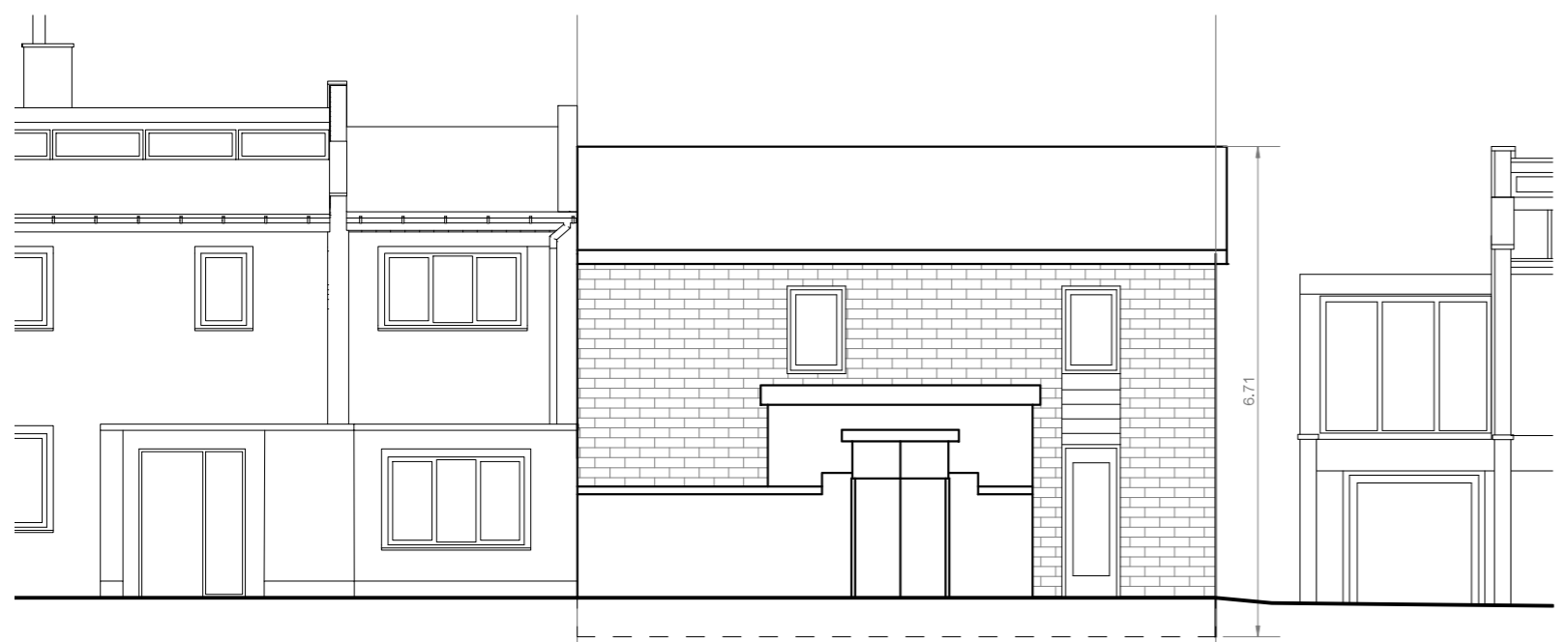
PROPOSED FRONT ELEVATION SCALE 1:100 @ A3