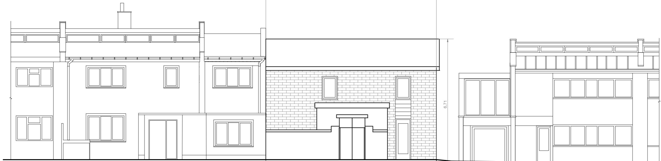
EXISTING ORNAN ROAD ELEVATION SCALE 1:100 @ A3