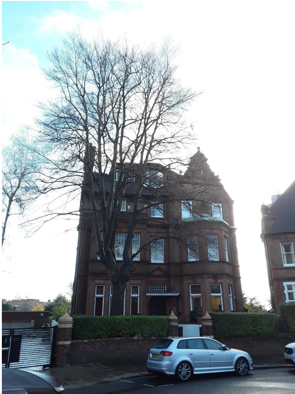
AEL-18129-PIC1 – Showing T.1 in front garden