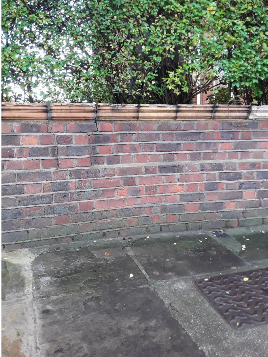
AEL-18129-PIC4 – Showing front boundary wall with crack that will require repair.