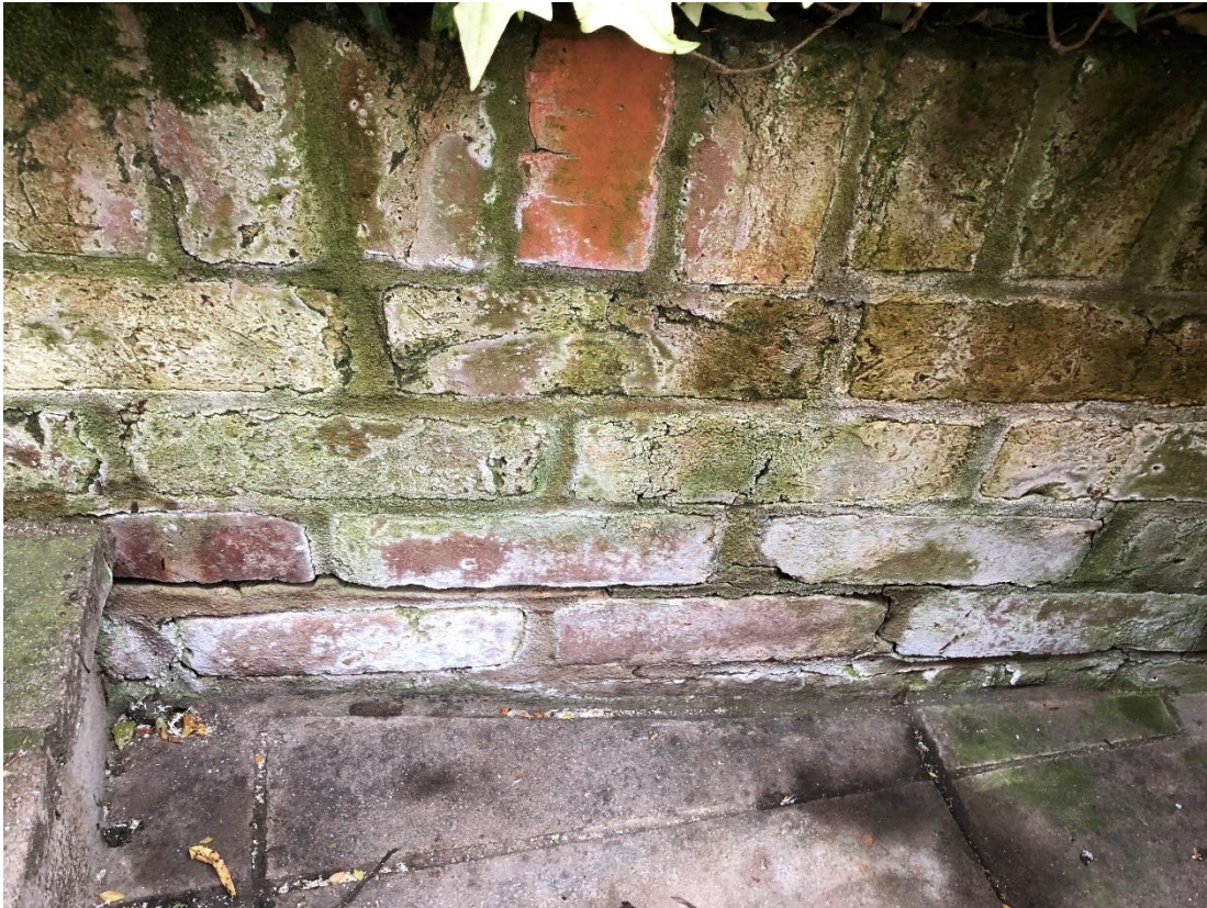
AEL-18129-PIC2 – Showing small crack in wall close to T.1