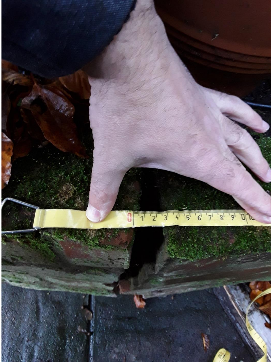
AEL-18129-PIC3 – Showing more significant crack in wall that will require repairing.