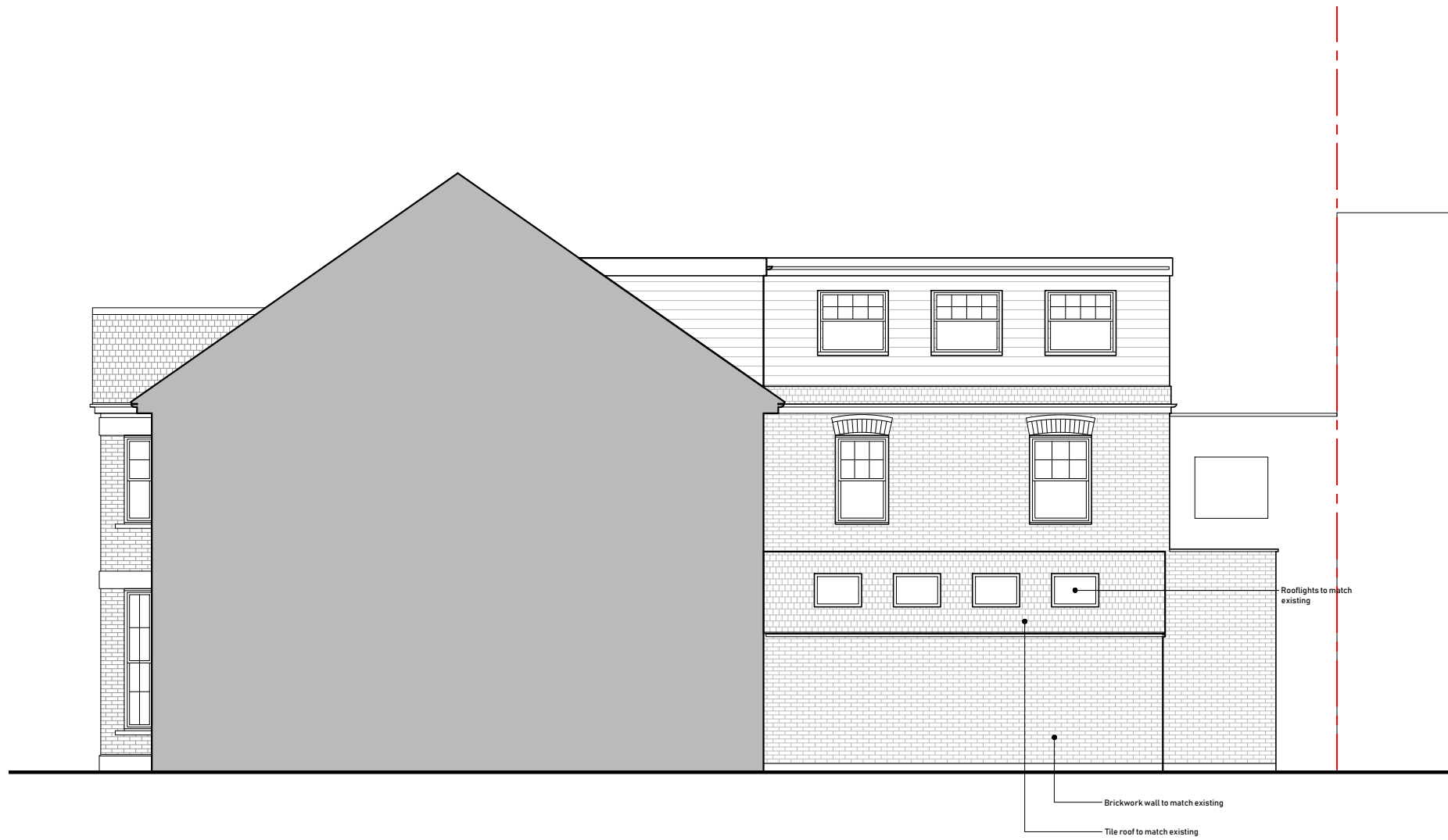
Proposed Rear Elevation Scale 1:100 @ A3