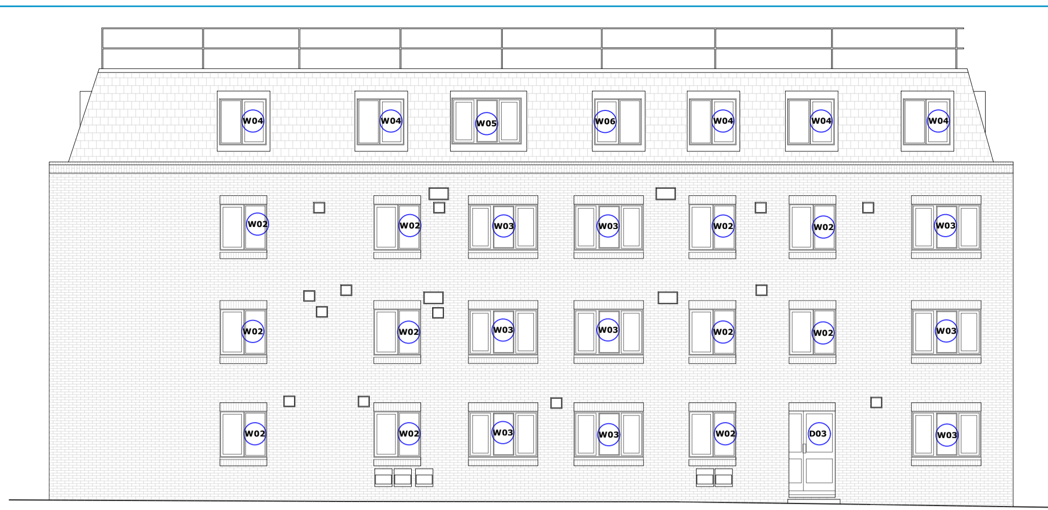
2 Existing South-West Elevation Scale: 1:100 @ A1