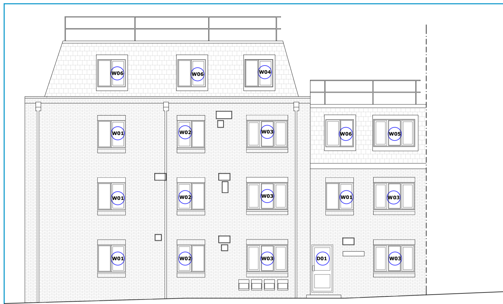
1 Existing South-East Elevation Scale: 1:100 @ A1