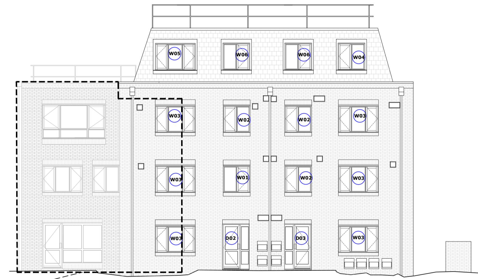
8 Proposed North-West Elevation Scale: 1:100 @ A1