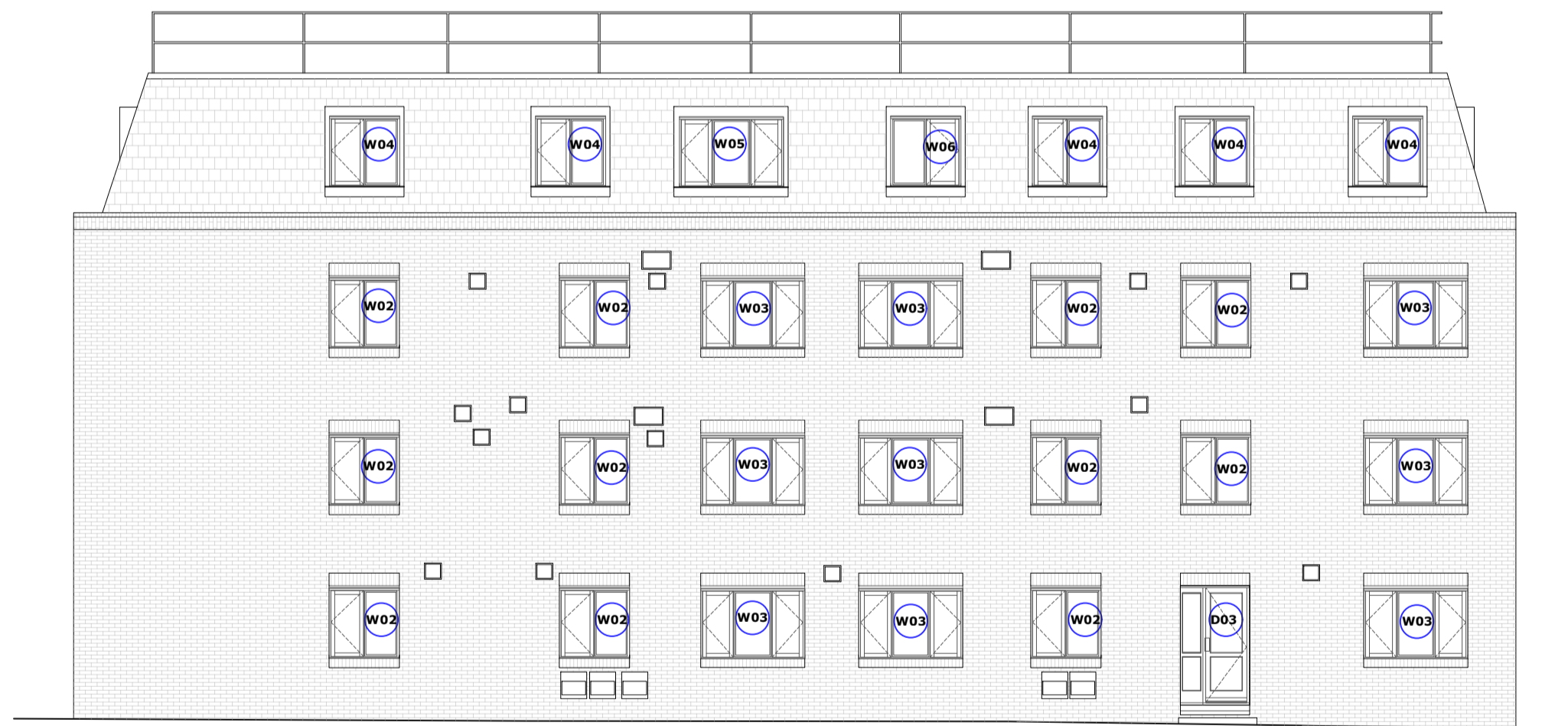
7 Proposed South-West Elevation Scale: 1:100 @ A1