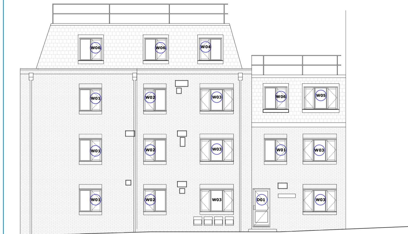
6 Proposed South-East Elevation Scale: 1:100 @ A1