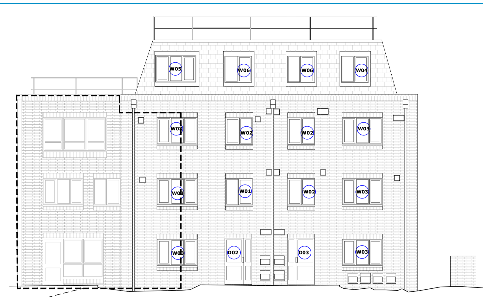
3 Existing North-West Elevation Scale: 1:100 @ A1