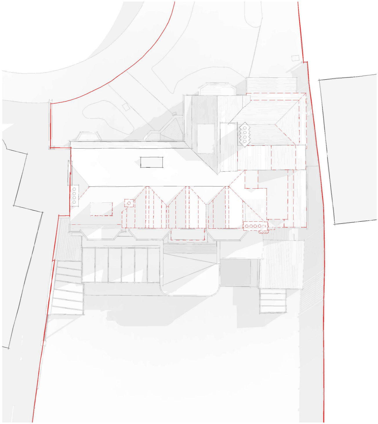
Roof Demolition Plan 1 : 100