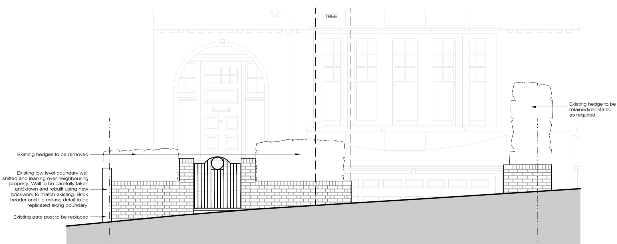
EXISTING STREET ELEVATION (FERNCROFT AVENUE) SCALE 1:50