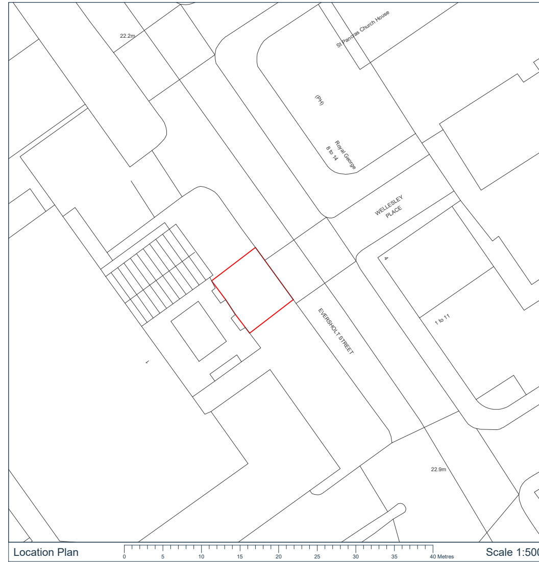
DETAILED SITE LOCATION