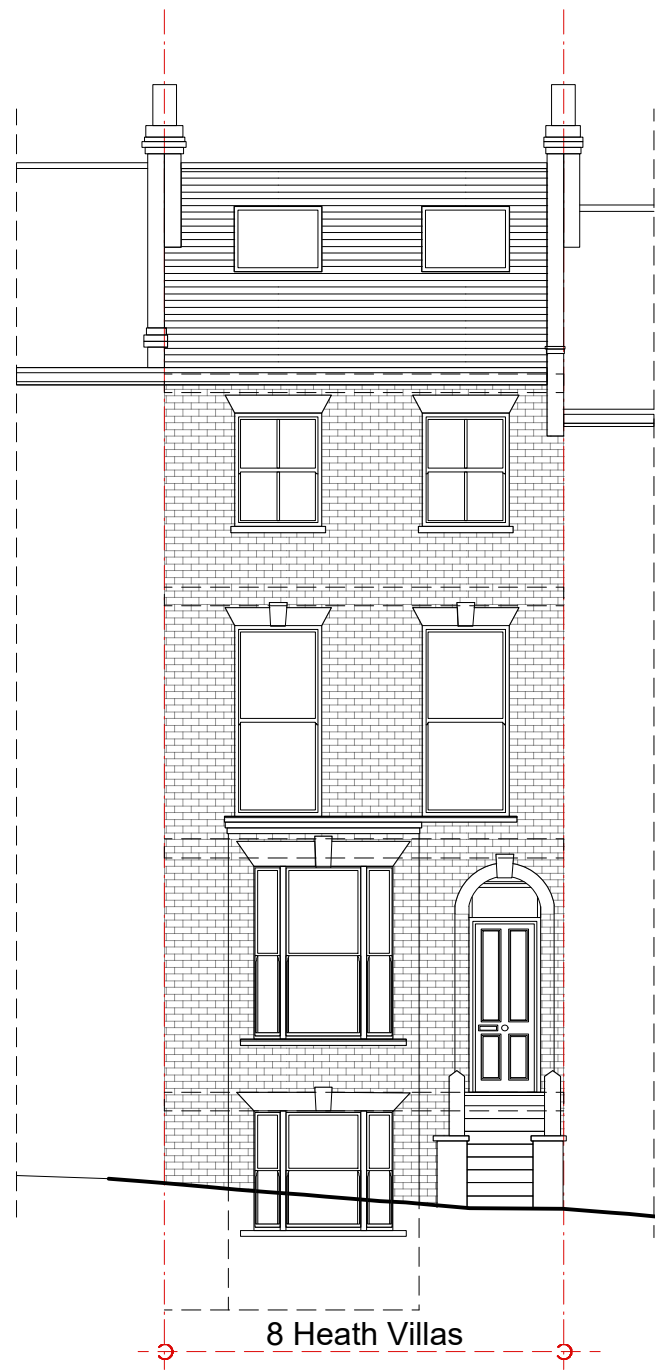
FRONT ELEVATION EXISTING