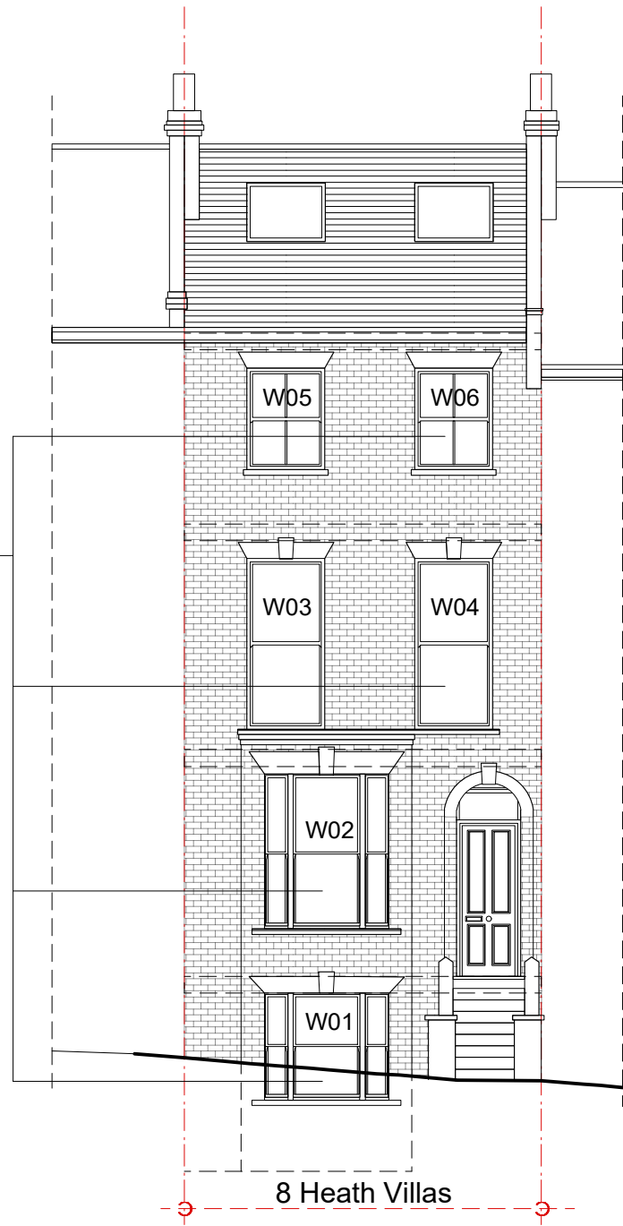
FRONT ELEVATION PROPOSED

new replacement painted hard wood sash windows to match original detail with double glazing