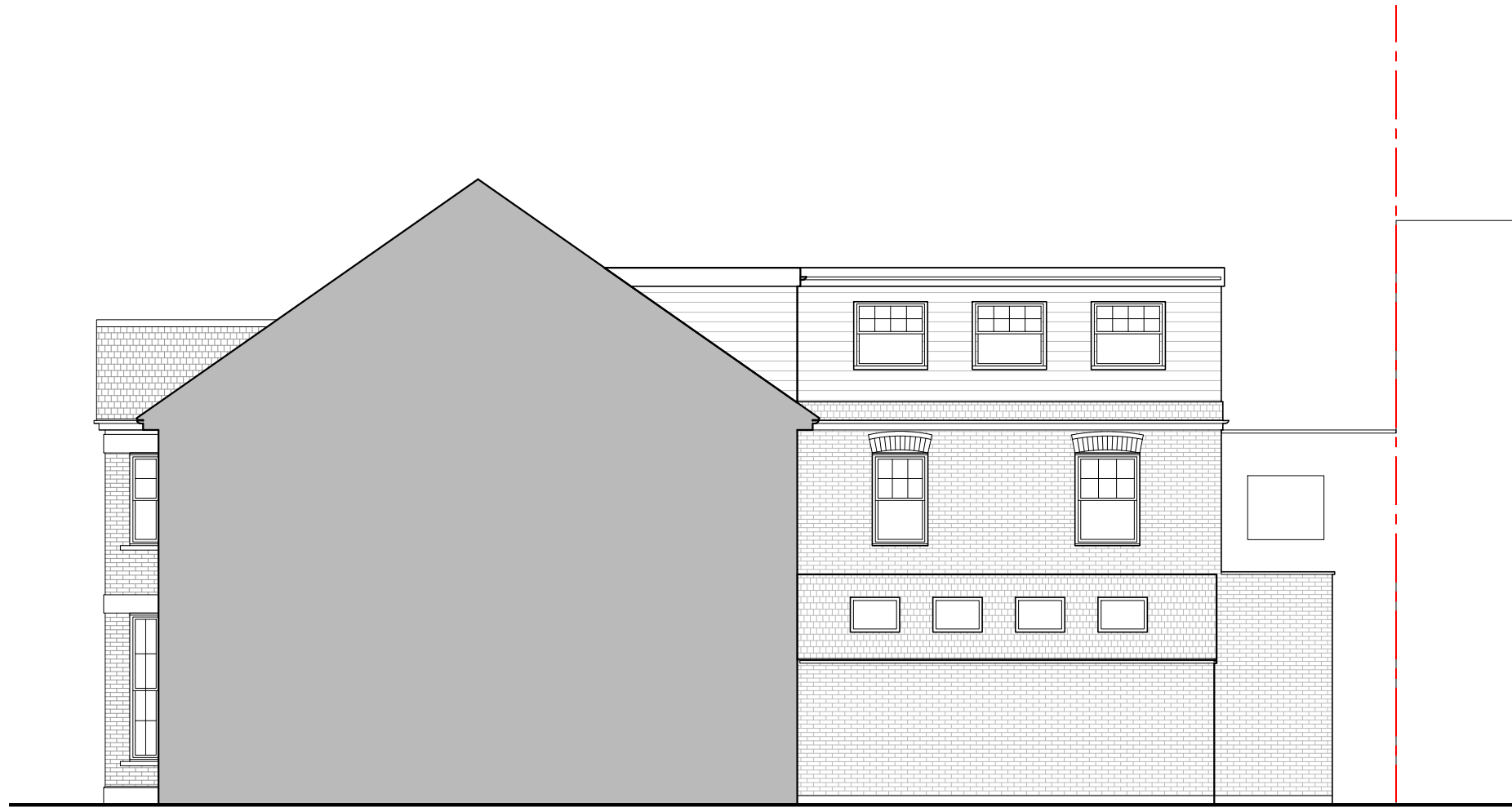
Proposed Rear Elevation Scale 1:100 @ A3