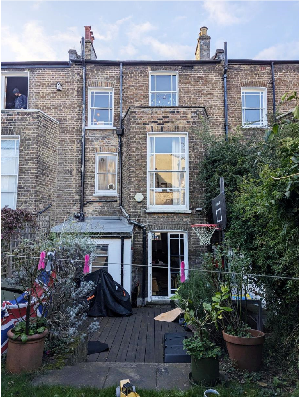
General view of rear elevation