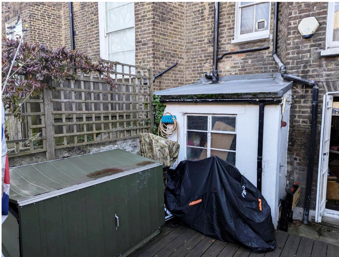
Boundary with number 32