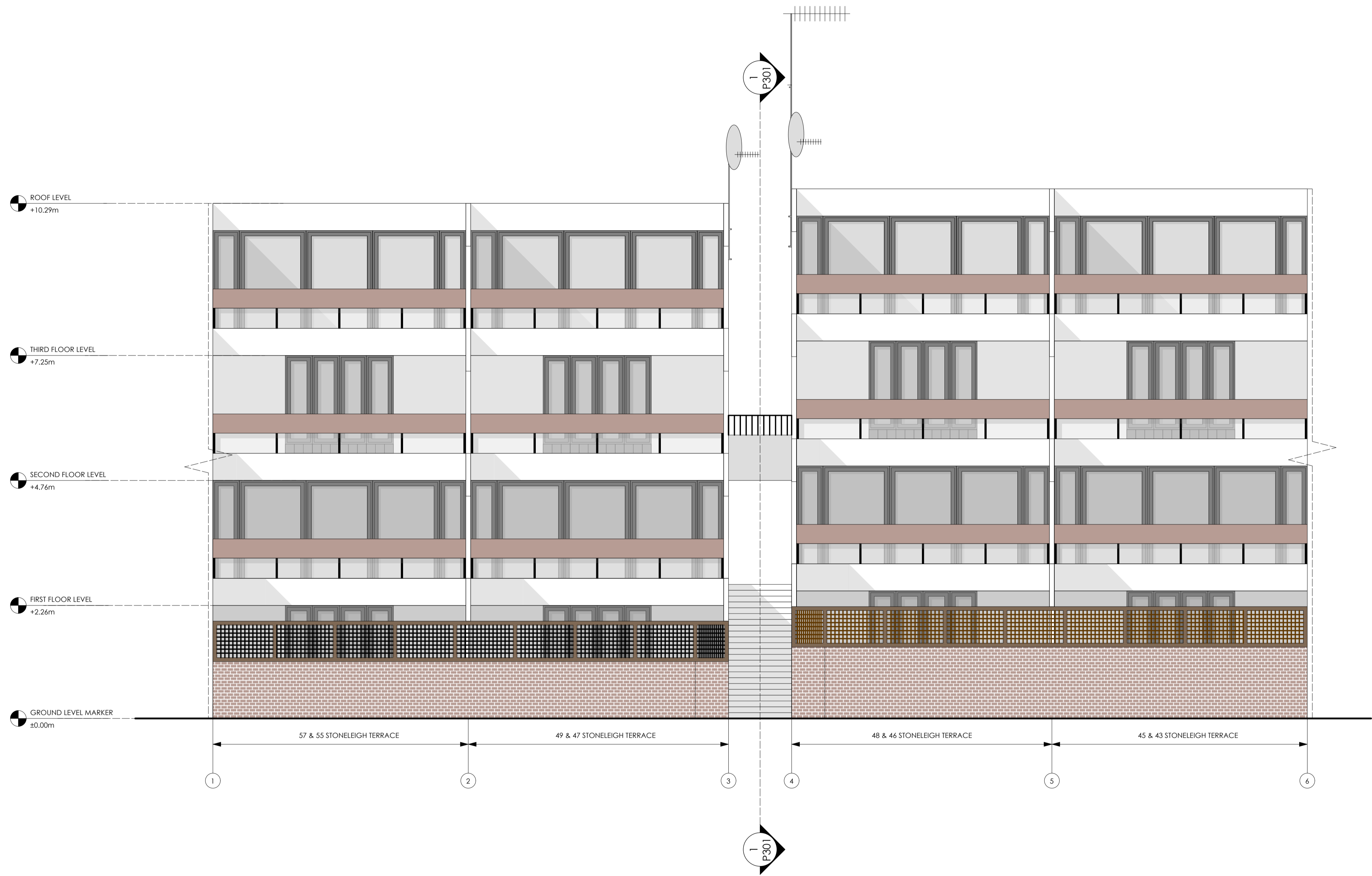
1 SOUTH EAST ELEVATION - RAYDON STREET 1:50