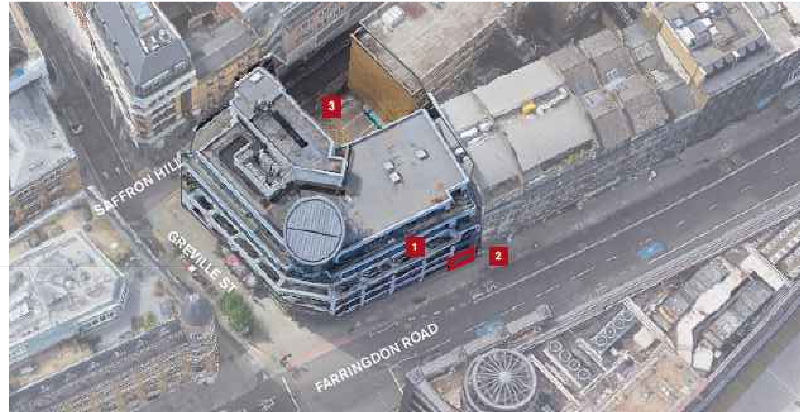
Google view of the building in context Not at scale