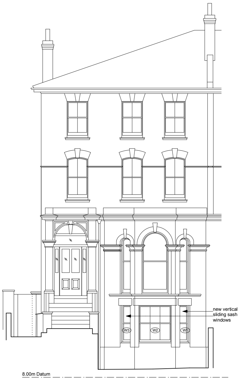
Proposed Front Elevation (NO CHANGES)