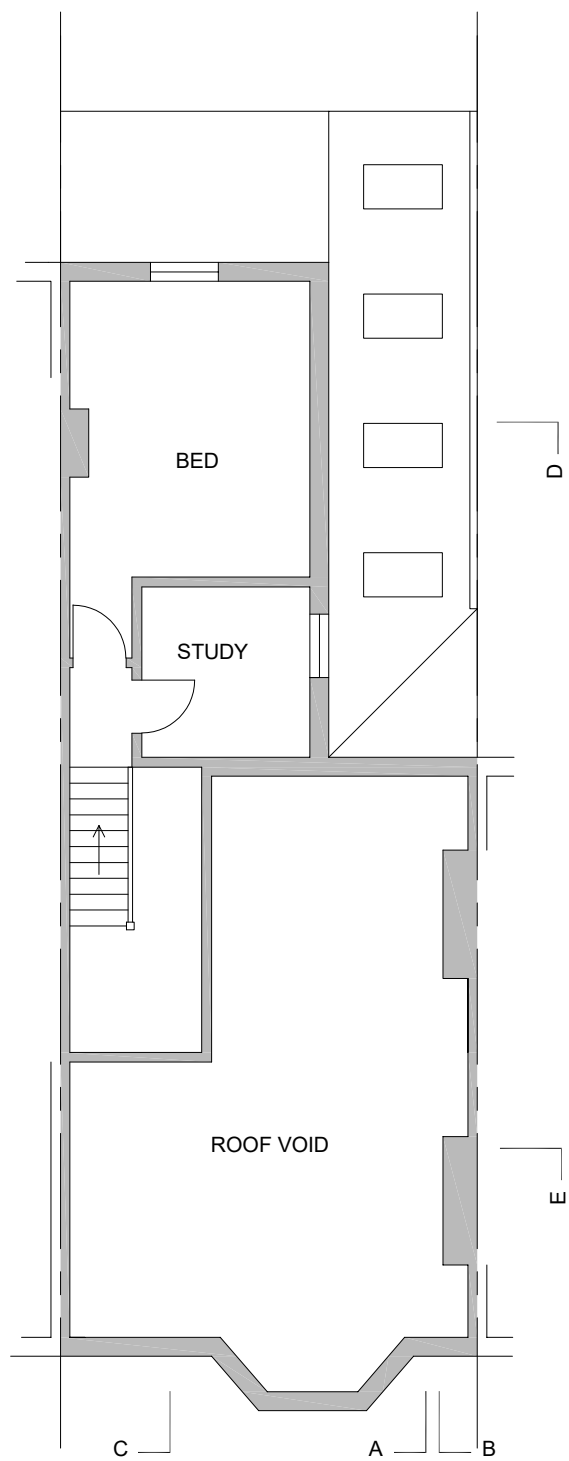
SECOND FLOOR PLAN 20 M2