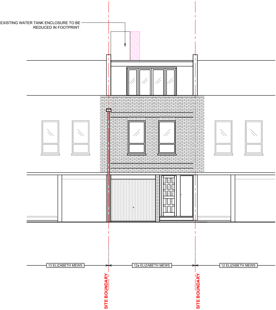
1 FRONT ELEVATION - DEMOLITION_ SCALE 1:100 @ A3