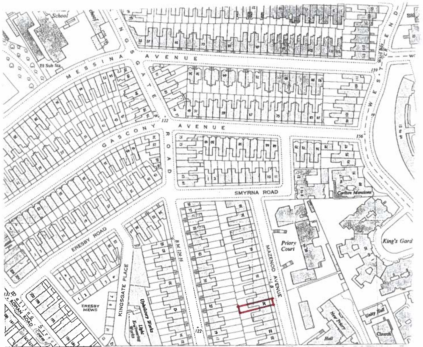
site plan - scale 1:1250