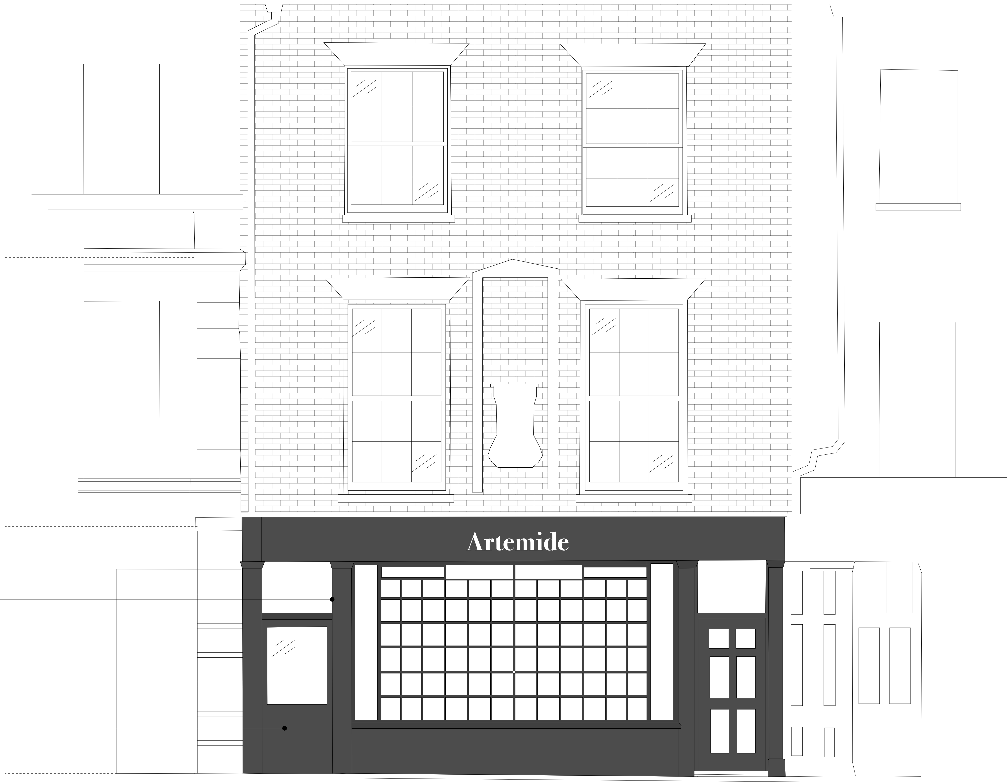
I Proposed Front Elevation Scale: 1:25