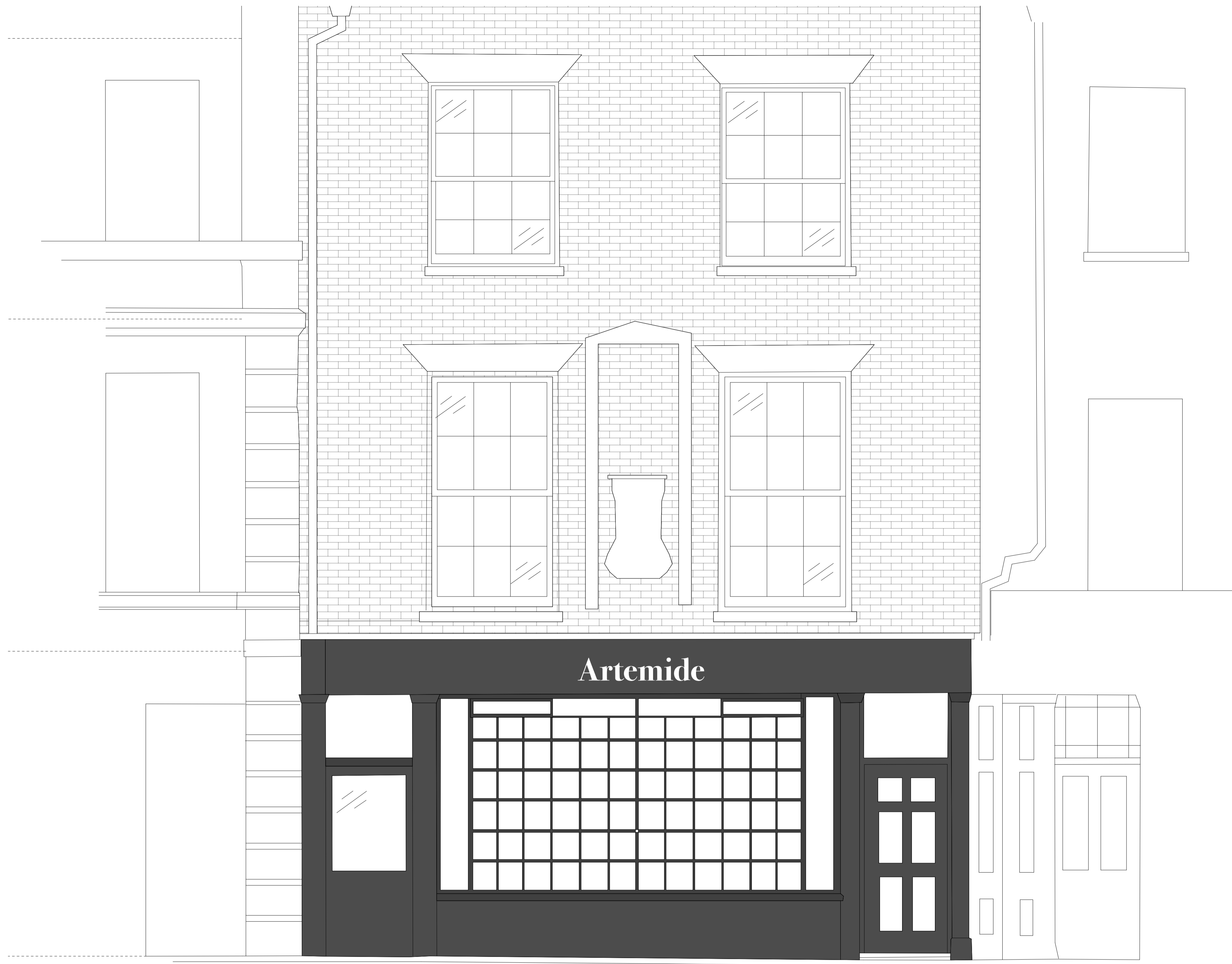
1 Existing Front Elevation Scale: 1:25